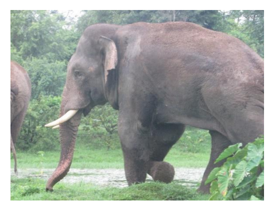
Tusker in Koshi Tappu Wildlife Reserve, Natural Habitat.