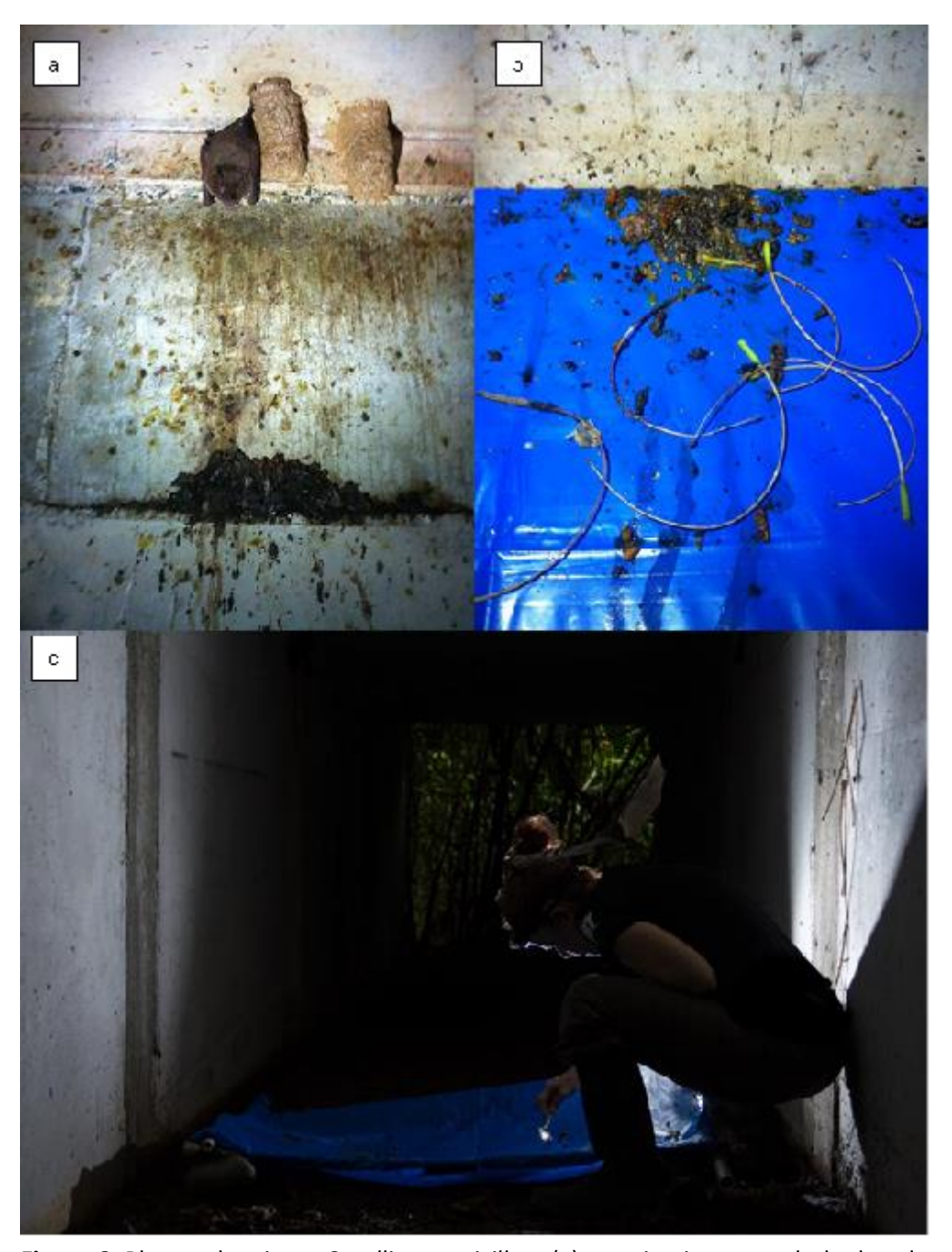
Figure 6. Photos showing a Carollia perspicillata (a) roosting in a tunnel, the bat droppings gathered on a plastic bat (b), and Gloriana Chaverri collecting the seeds (c). Note the bat flying towards Gloriana's head in c.