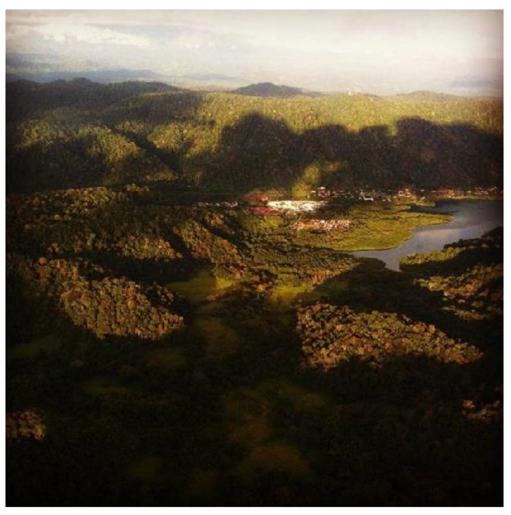
Figure 10 . Photo of the town of Golfito, in southwestern Costa Rica, showing pastures previously used for cattle. These areas have not been able to recover even after cattle were removed 25 years ago. This is one area that can potentially benefit from forest recovery treatments using bat seeds.