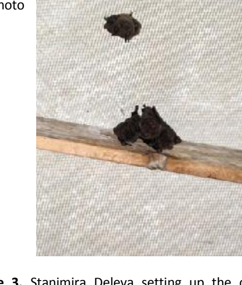
Figure 2. A small colony of four Carollia perspicillata inside one of the bat boxes constructed during our study.