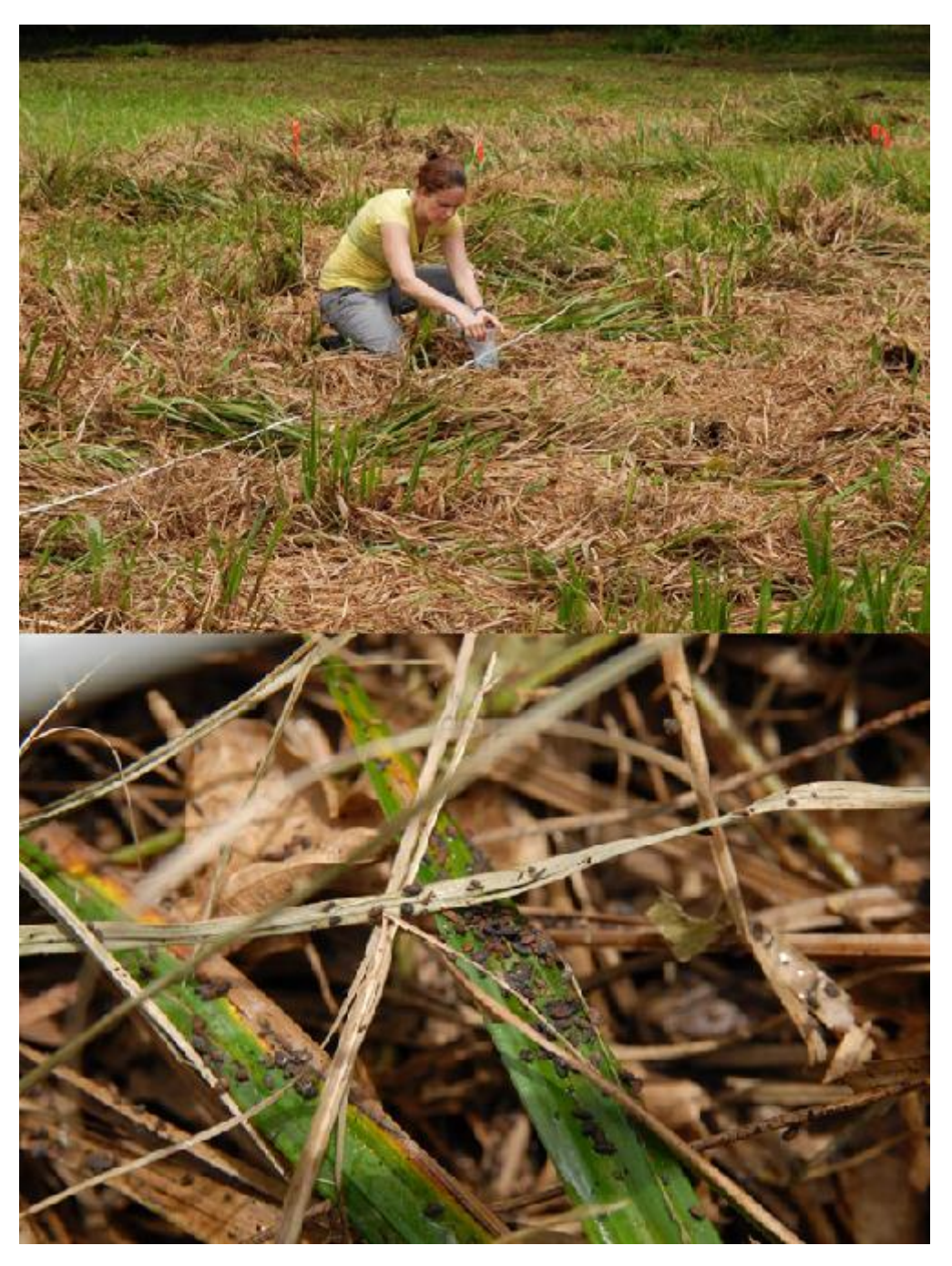
Figure 7. Gloriana Chaverri sowing seeds (top photo), and close-up of clumped seeds sown in pastureland (bottom photo).