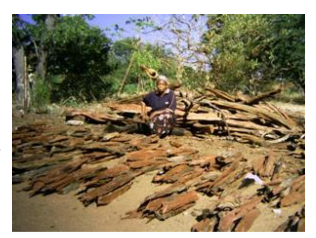
Fig 5 commercial firewood collection for sale from KFR