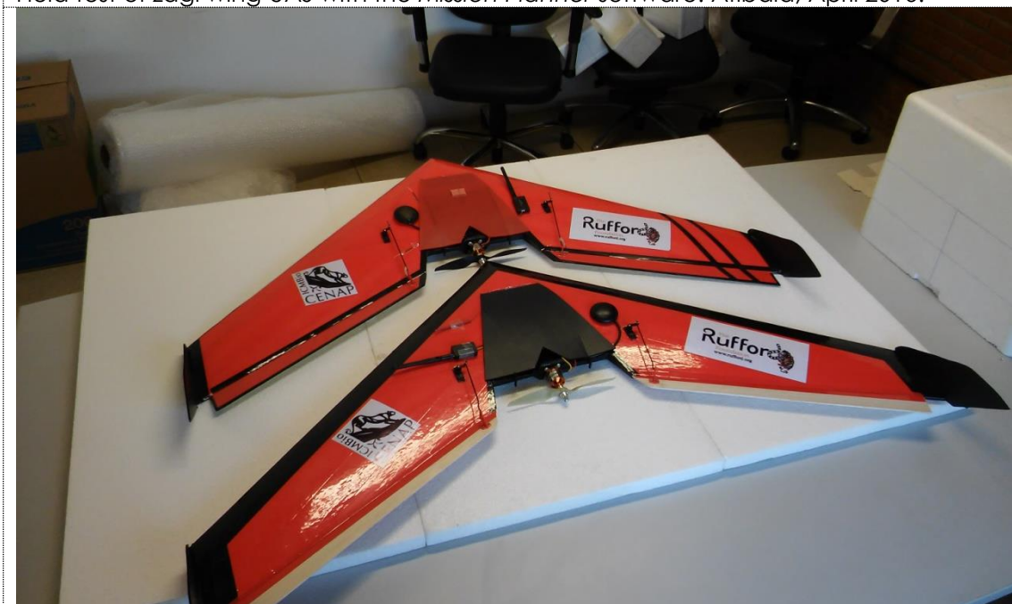
Two zagi wing UAS ready to go to GSVNP. Atibaia, May 2016