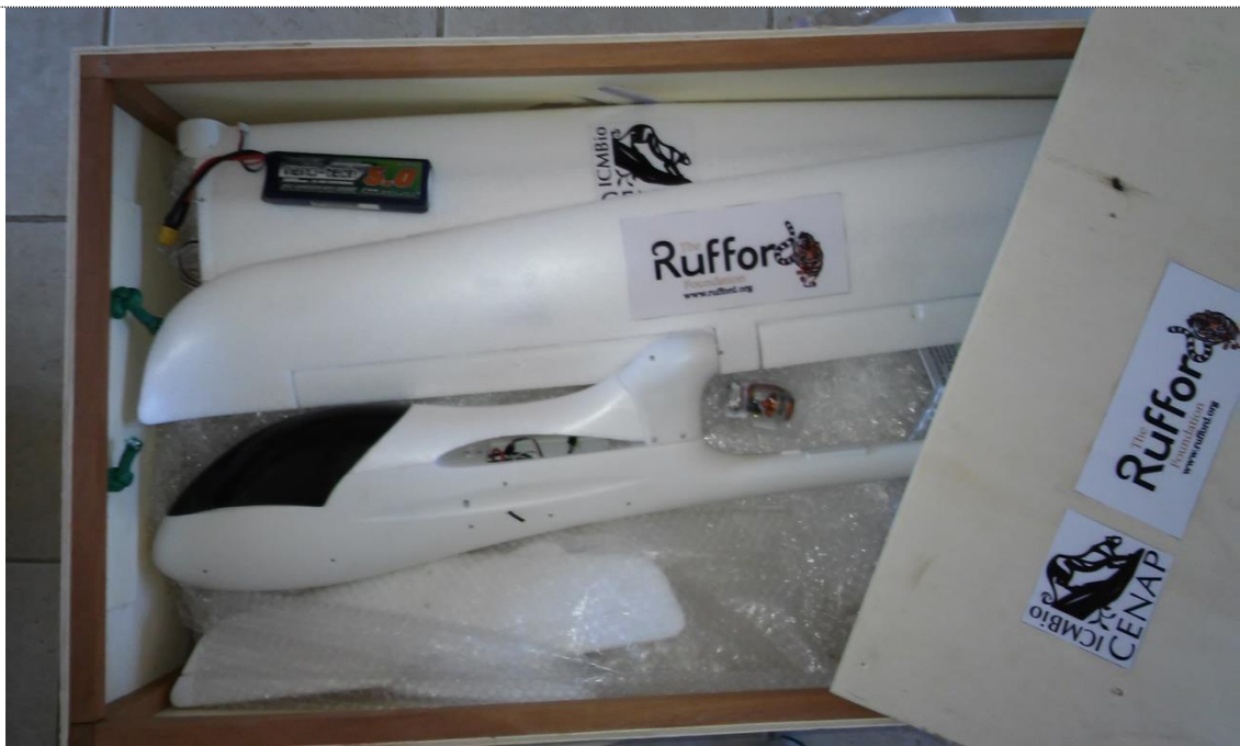
One of the FPV Raptors inside transport box, ready for transport to GSVNP. Atibaia, May 2016