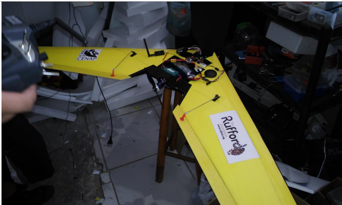
A "zagi wing" UAS, ordered as an alternative to the FPV Raptor. Atibaia, April 2016.