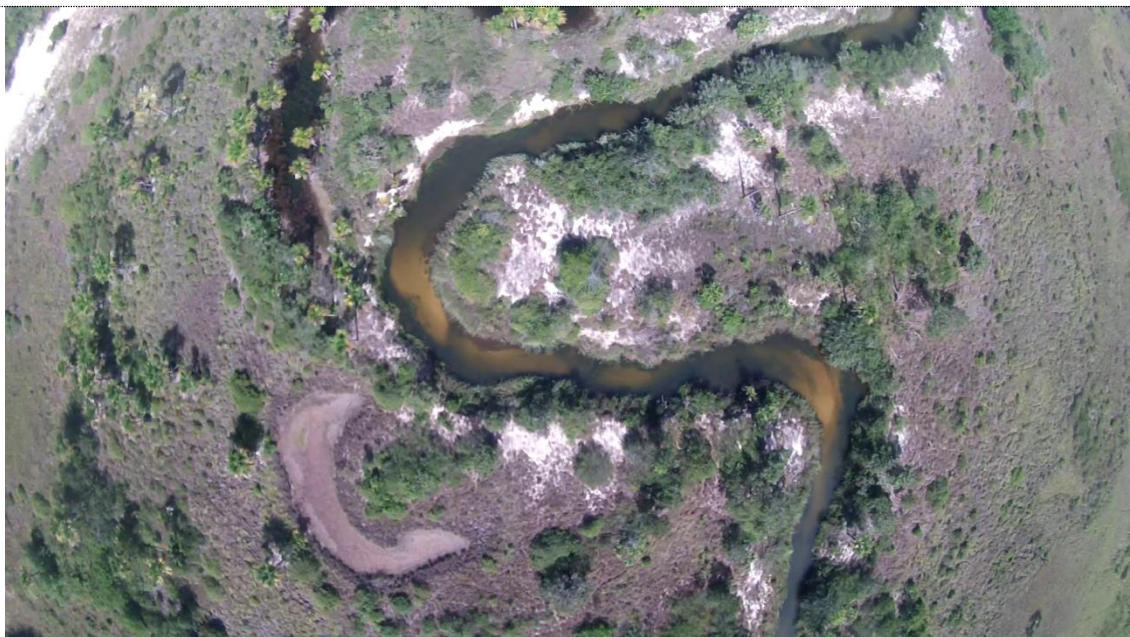
Image taken during a river mission at GSVNP. May 2016