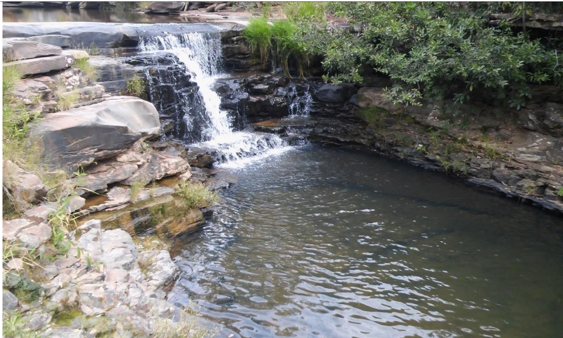
The Mato Grande waterfall at GSVNP. Chapada Gaúcha, May 2016