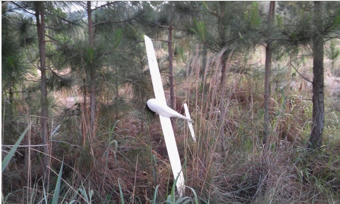
FPV Raptor crash. Atibaia, October 2016.