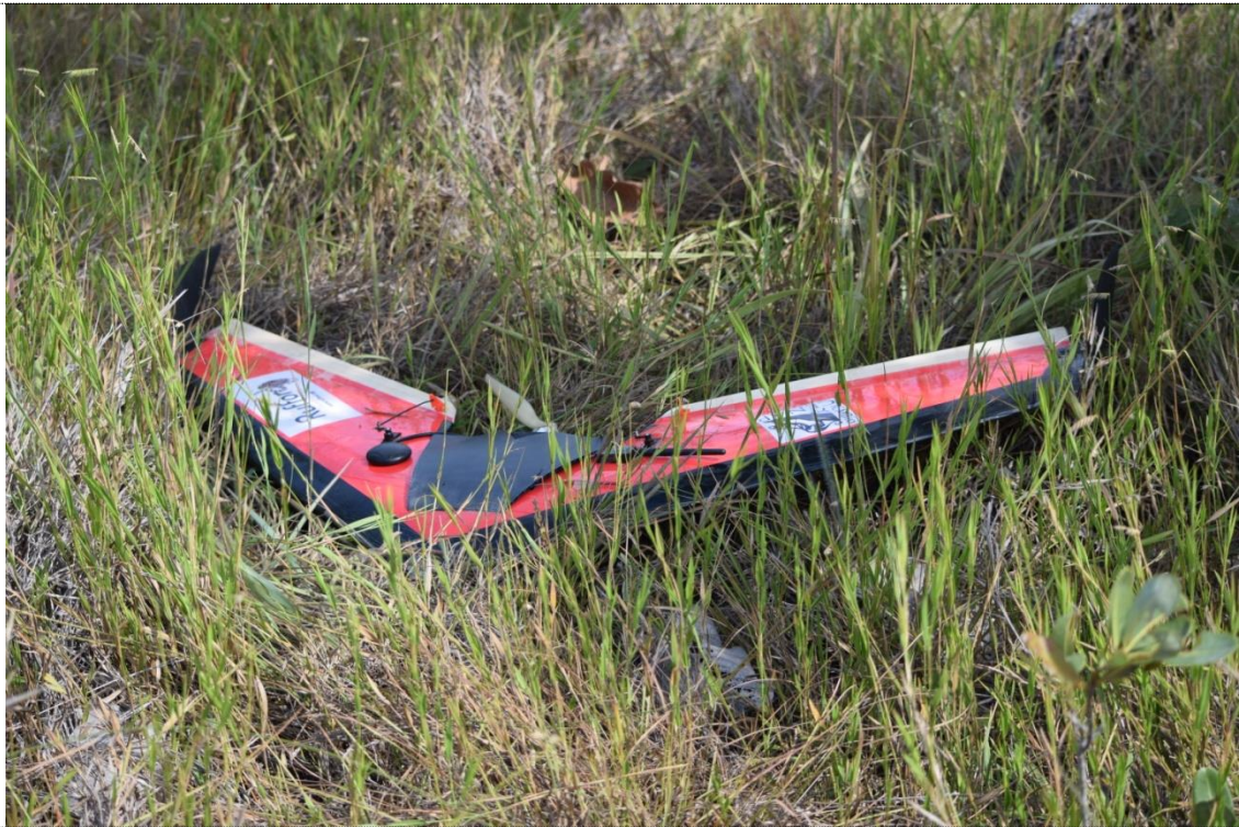
One of our UAS after landing. Chapada Gaúcha, May 2016.