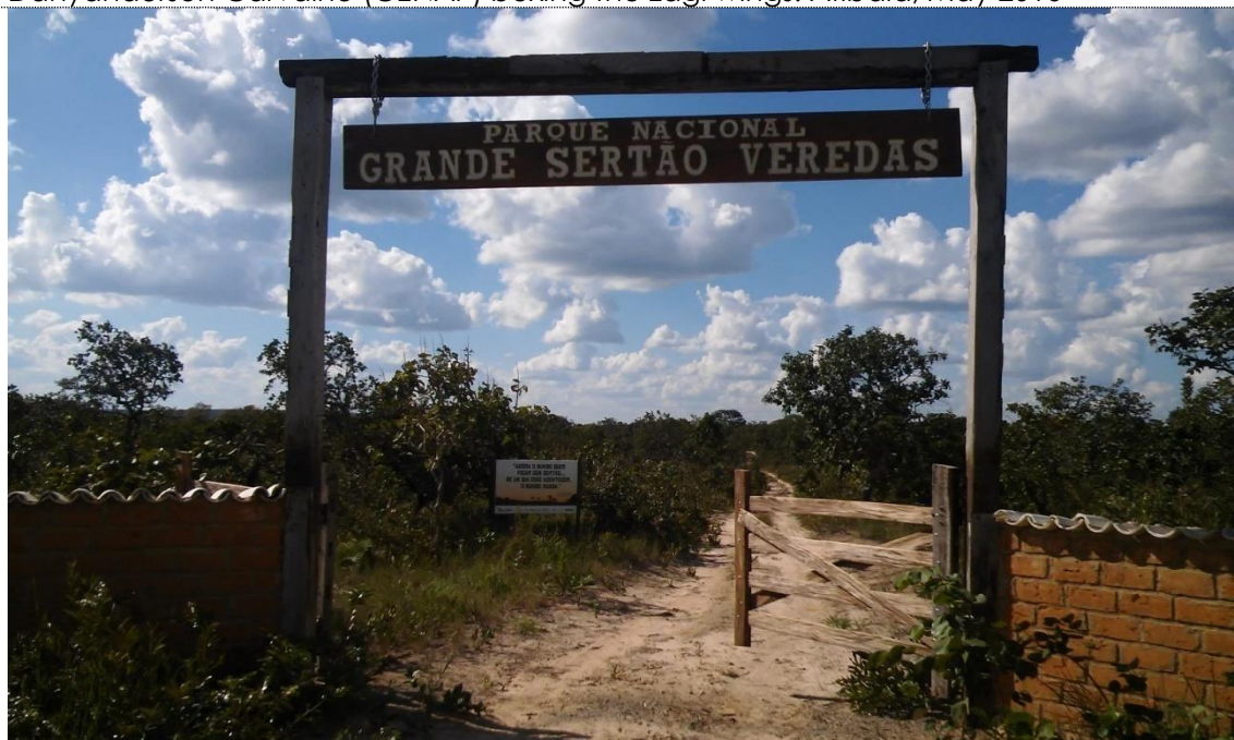
Entrance of Grande Sertão Veredas National Park (GSVNP). Chapada Gaúcha, May 2016