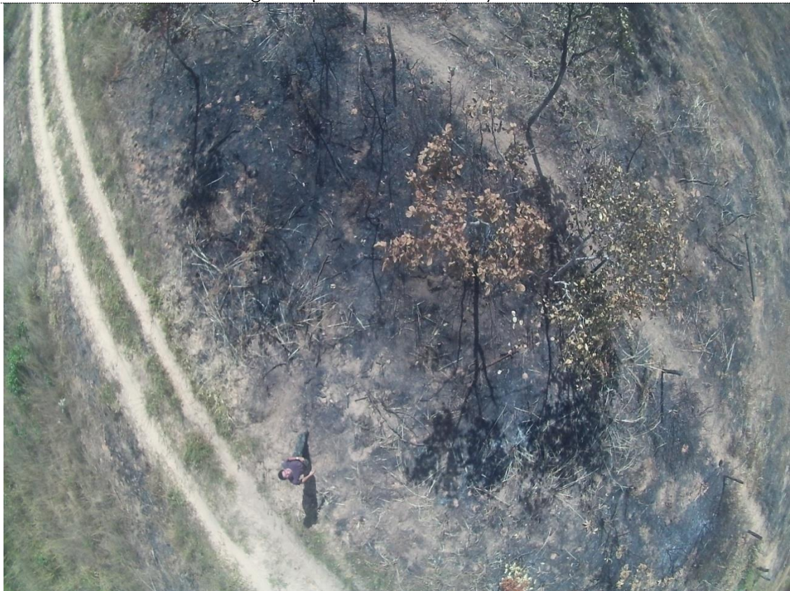
Photo taken by the UAS of a person walking in a burned area inside GSVNP. May 1016