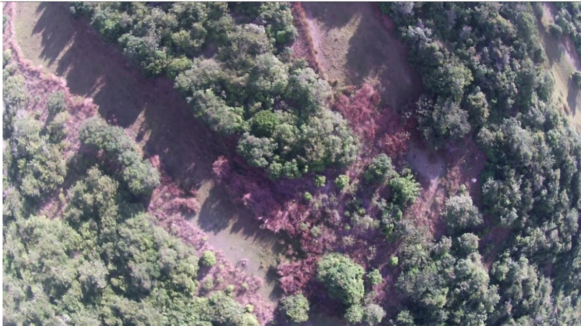
A dry oxbow lake at GSVNP. May 2016