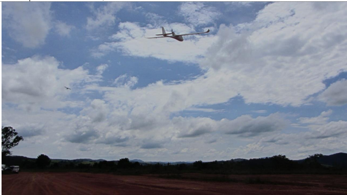
FPV Raptor in the air. Atibaia, March 2016.