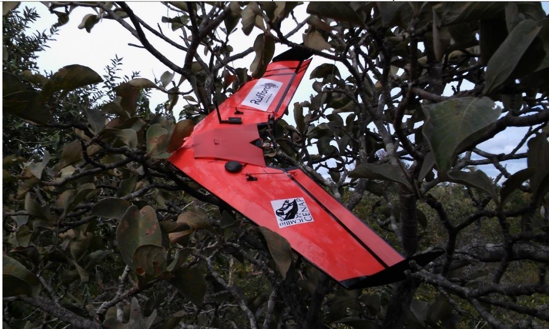
A bad landing at GSVNP. Chapada Gaúcha, May 2016