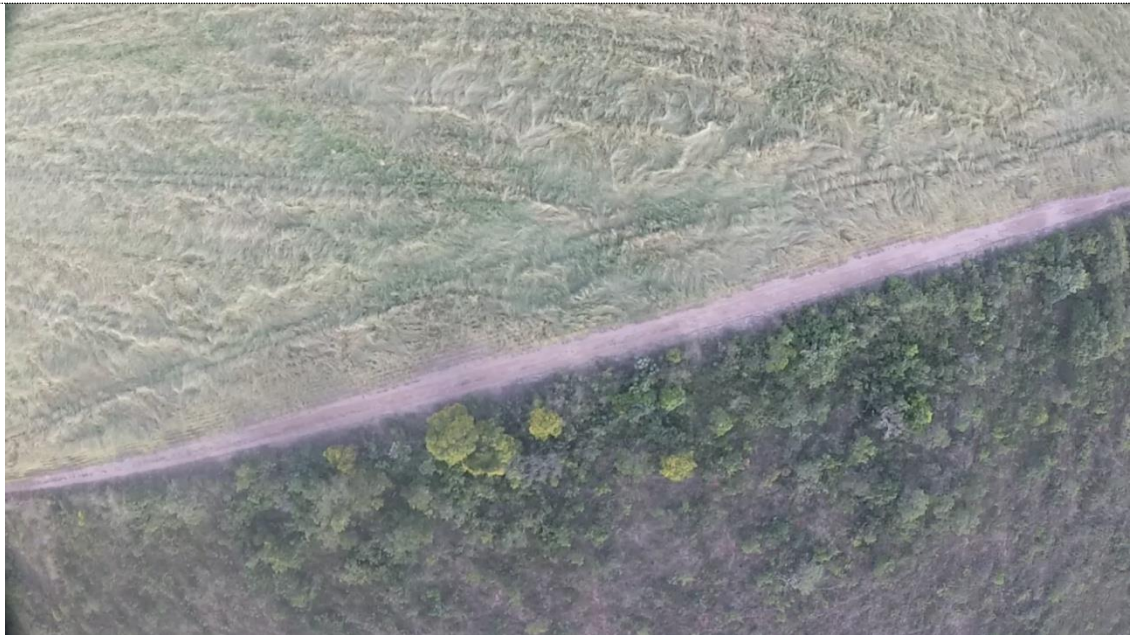
A sharp edge between GSVNP and surrounding farmland. May 2016