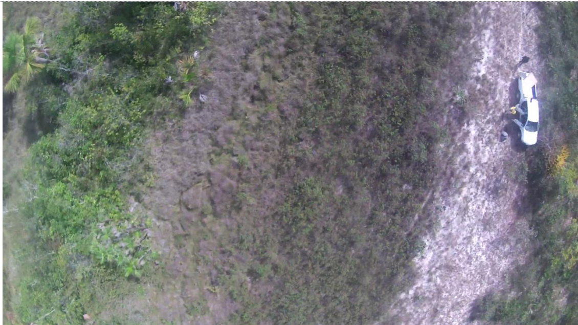
Photo taken by the UAS of our vehicle in the park. May 2016