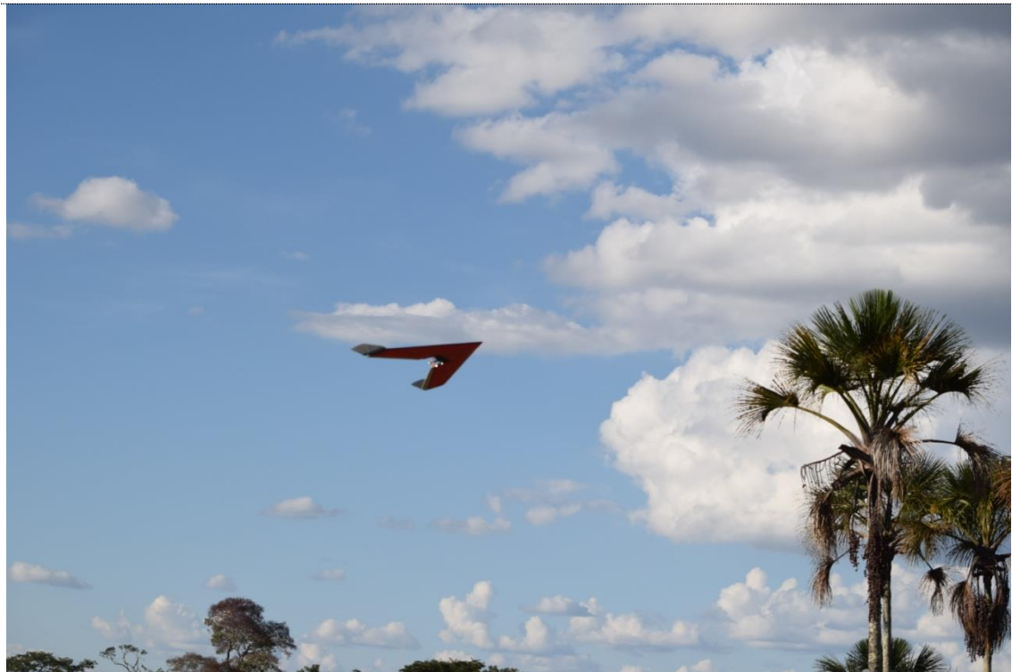
One of the UAS flying at GSVNP. Chapada Gaúcha, May 2016