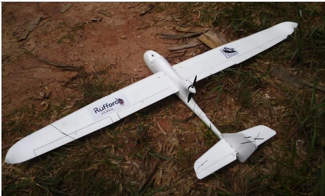
One of the FPV Raptors before a flight test. Atibaia, March 201