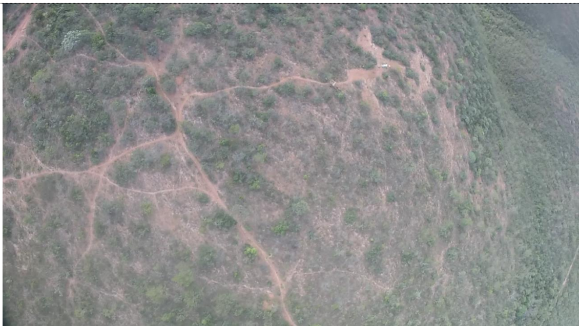
Heavily grazed area near the limits of GSVNP. May 2016