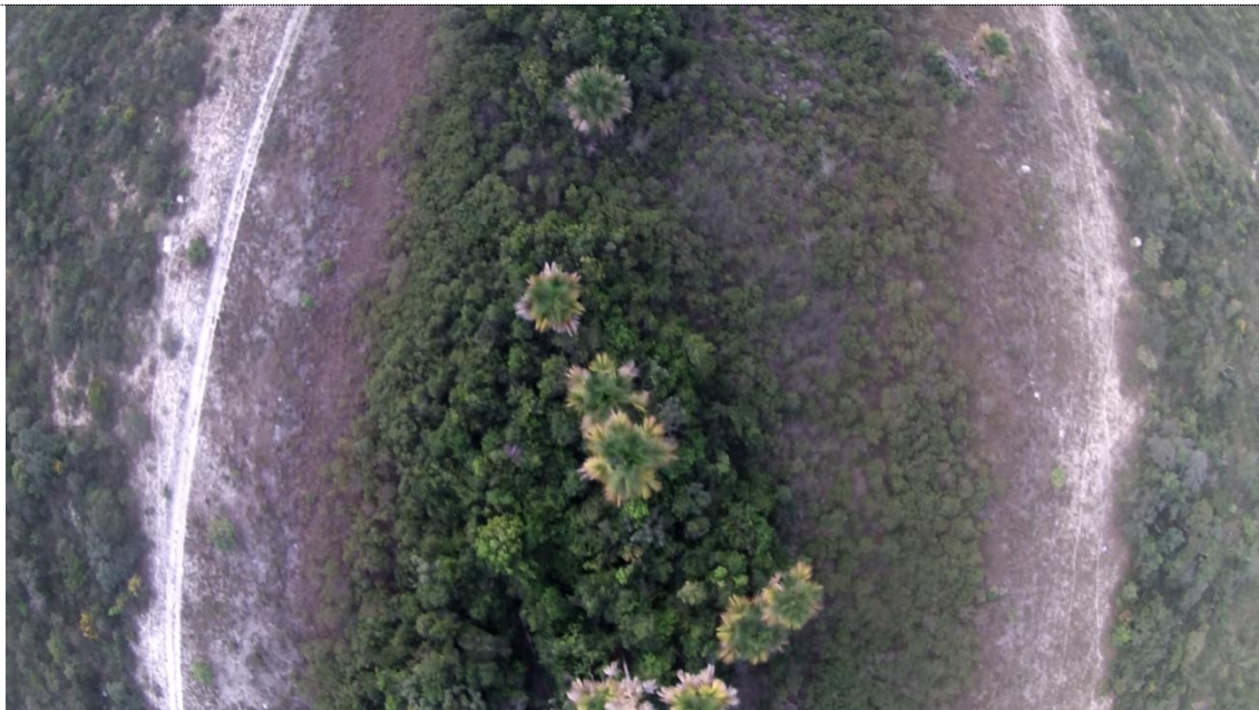
Aerial view of a vereda, typical environment of GSVNP. May 2016