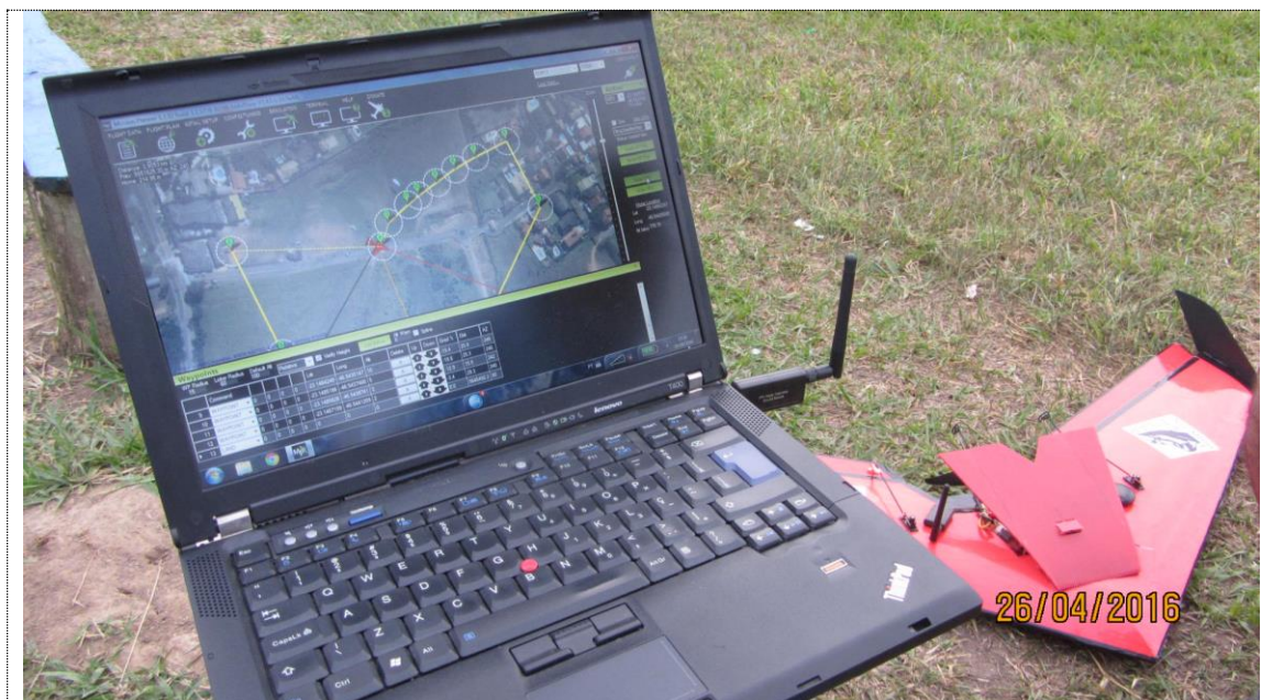
Field test of zagi wing UAS with the Mission Planner software. Atibaia, April 2016.