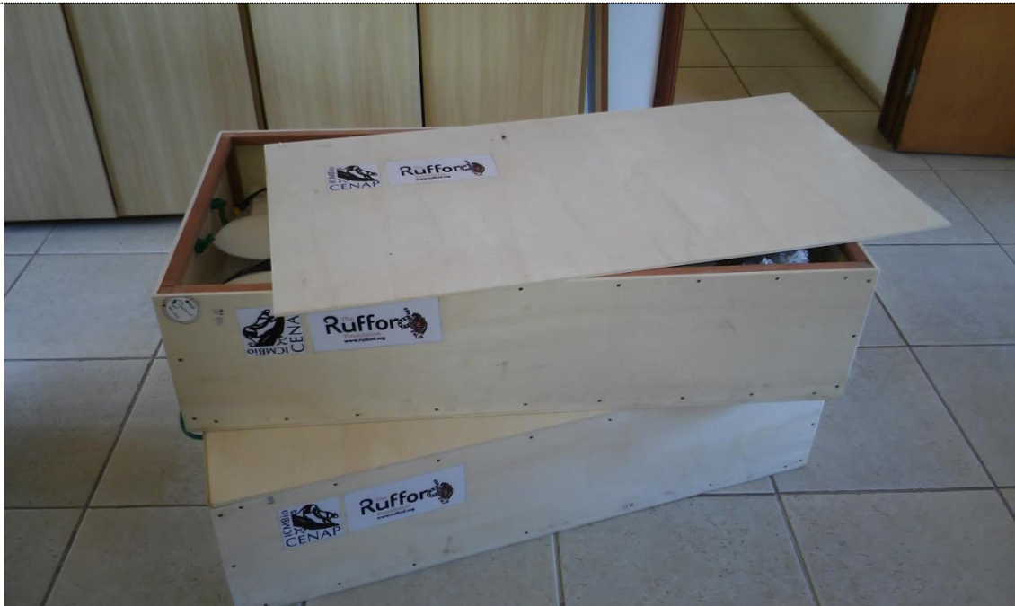
Transport boxes made for transporting the FPV Raptors to GSVNP. Atibaia, May 2016.