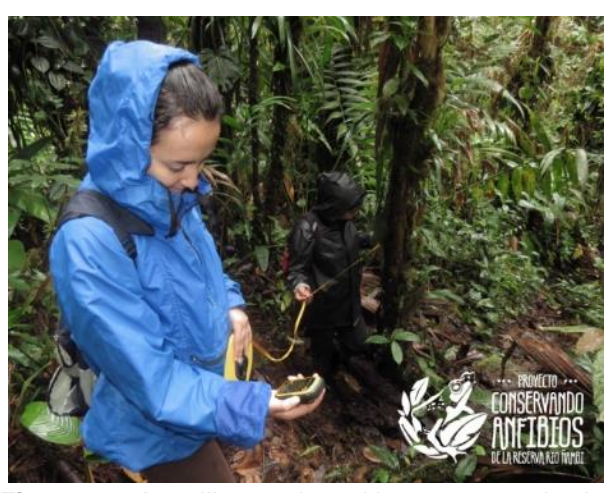
Figure 11. Installing and marking transects in the day. At night, these transects were surveyed to monitoring the three amphibian species included in this project.