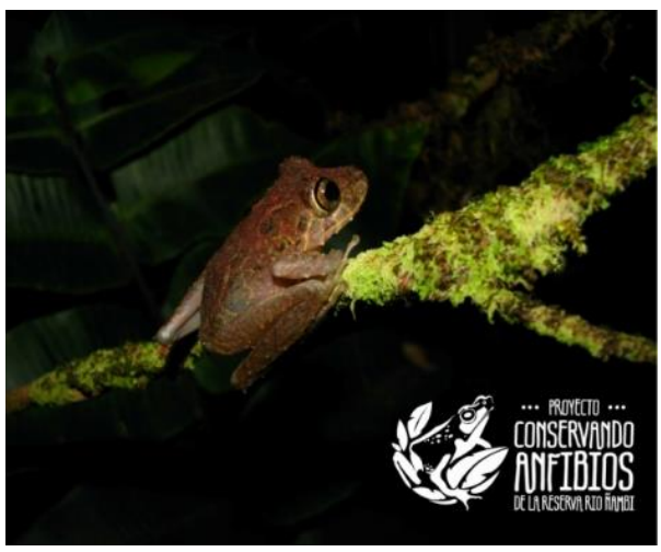
Figure 16. Adult of the frog Pristimantis labiosus (Anura: Craugastoridae)