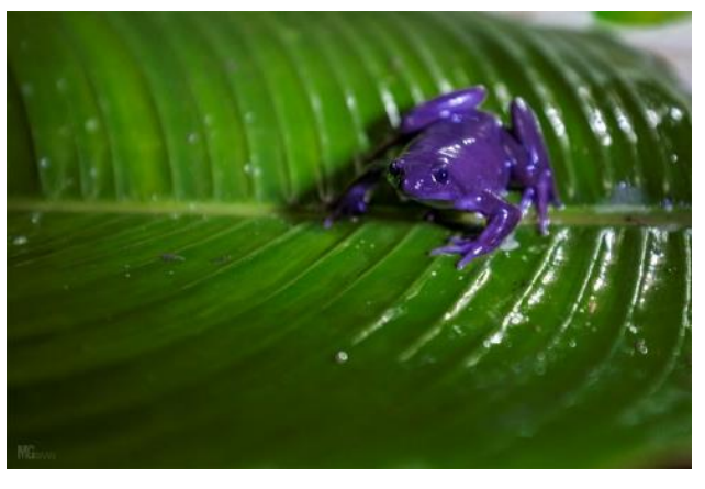
Figure 21. Adult frog Ctenophryne aterrima (Anura: Microhylidae).