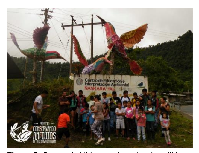
Figure 5. Group of children and youth, who will be future environmental interpreters in the "Reserva Natural Río Ñambí".