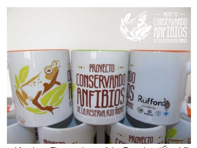
Figure 22. Mugs stamped with the logo of the project and funders. First products of the Eco-shop "Ñambí".