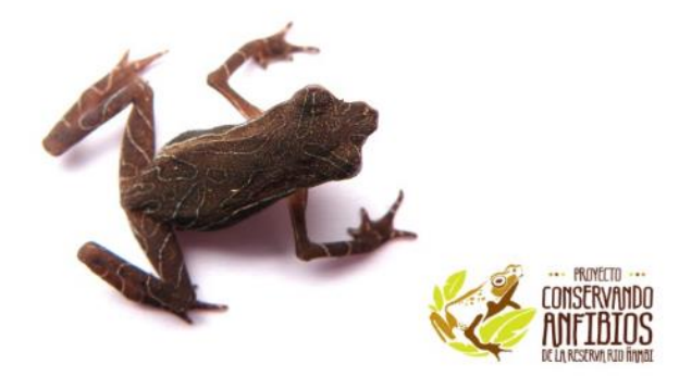
Figure 13. Juvenil of the endangered species Andinophryne colomai (Anura: Bufonidae).