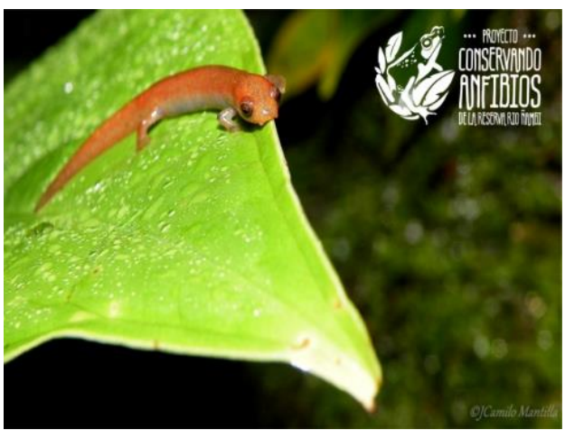
Figure 15. Adult of the threatened salamander Bolitoglossa medemi (Caudata: Plethodontidae)