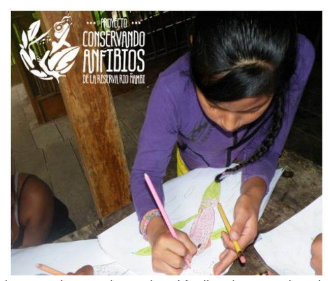
Figure 7. Contest drawing and painting on the three endangered species ( Andinophryne colomai , Pristimantis verecundus and Bolitoglossa medemi ) occurring in the "Reserva Natural Río Ñambí".