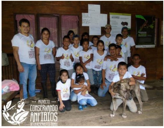
Figure 8. Children from school and nearby villages visiting the Researchers home in the "Reserva Natural Río Ñambí".