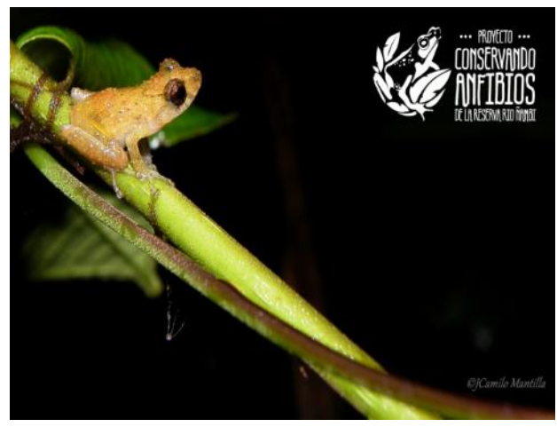
Figure 14. Adult of the threatened frog Pristimantis verecundus (Anura:Craugastoridae)