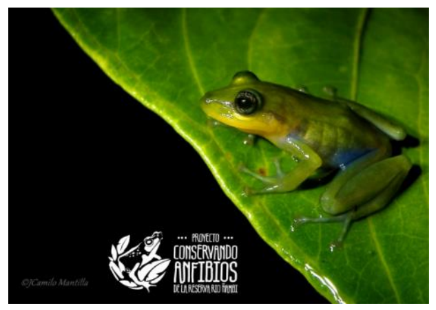
Figure 18 . Adult frog Pristimantis sp. (Anura: Craugastoridae).