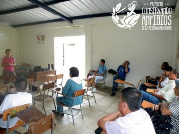
Figure 1. Meeting with students (left) and teachers (right) of the school "Santa Teresita de Altaquer" (CSTA), in which we explained the goals of the ecological research and environmental education to be carried out in the Reserva Natural Río Ñambí.