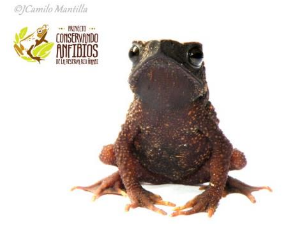
Figure 12. Adult female of the endangered frog Andinophryne colomai (Anura: Bufonidae).