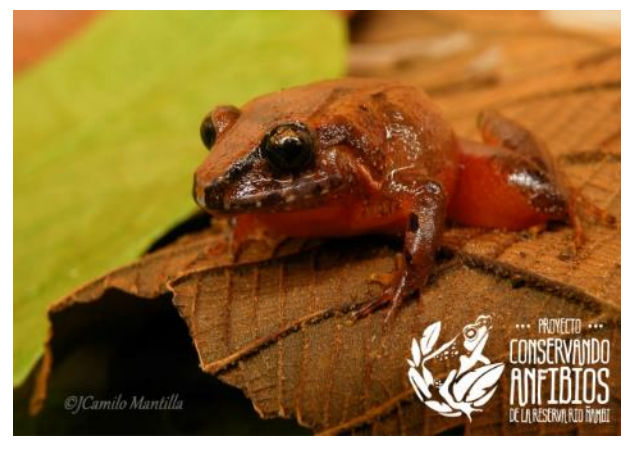
Figure 19 . Juvenil frog Hypodactylus babax (Anura: Craugastoridae).