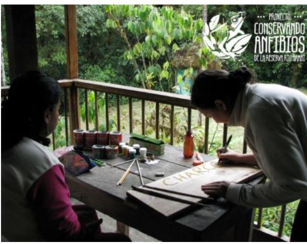
Figure 6. Preparing workshops for children and youth.