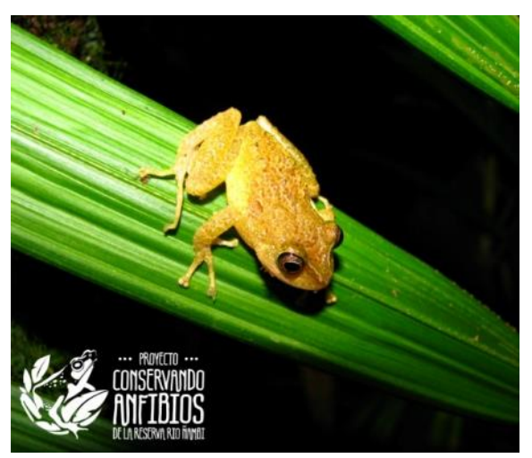
Figure 17. Adult of the frog Pristimantis latidiscus (Anura: Craugastoridae).