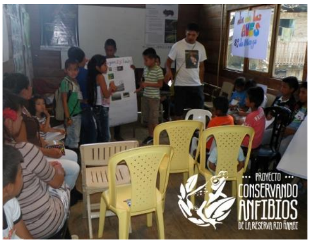
Figure 4. Workshop on major threats for amphibian conservation in the study area.