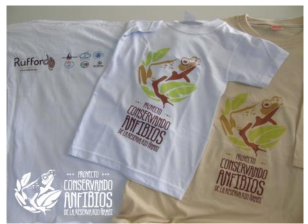
Figure 23. T-shirts stamped with the logo of the project and funders. First products of the Eco-shop "Ñambí".