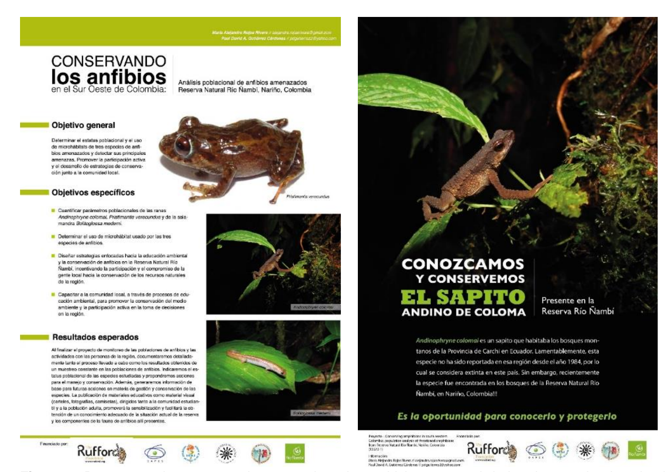
Figure 2. Posters used to promote the research project, which were used during the meeting in school "Santa Teresita de Altaquer" (CSTA), and finally left permanently exposed in the "Centro de Interpretación Ambiental Ñankara-Yal" (Environmental Interpretation Centre) and in the Reserva Natural Río Ñambí.