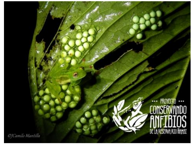
Figure 20. Male adult glassfrog Centrolene peristictum (Anura:Centrolenidae) attending its egg clutch.