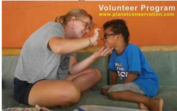
Volunteers get painted at Sea Turtle Conservation Festival 2014