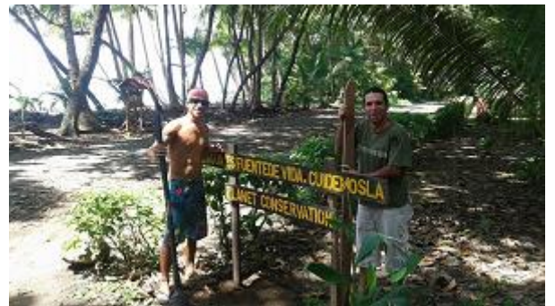
Sign elaboration and maintenance "More turtles – less garbage"