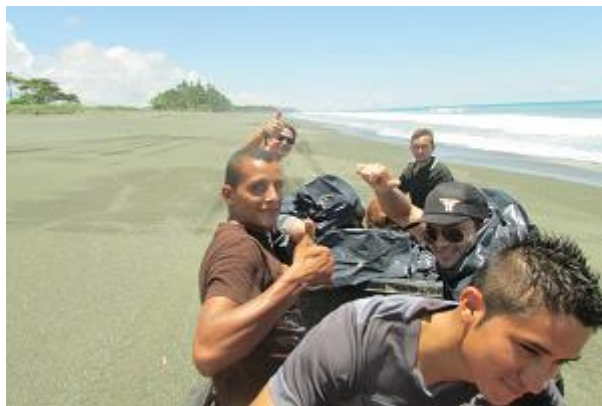
Beach Cleaning activity with Planet Conservation, local organizations, MINAE and Police. Hatchery Carate beach