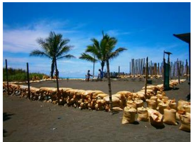
Elaboration of mashes to protect nests at the beach.