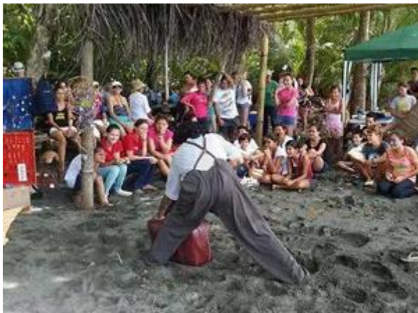
Clown at Sea Turtle Conservation Festival

We hope that you will be able to fund ongoing conservation efforts. Thank you very much for your trust and choice to support the Sea Turtle Conservation program in Carate. Enclosed some pictures from the project work.