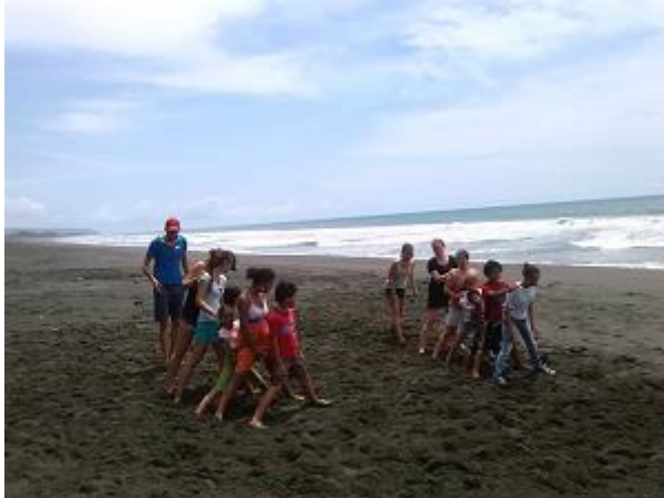
Activities with youth of the area