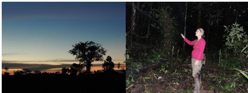
3. Amazon sunset, Alta Floresta, Mato Grosso State, Brazil 4. Researcher and sampling method most used for bats mist nets