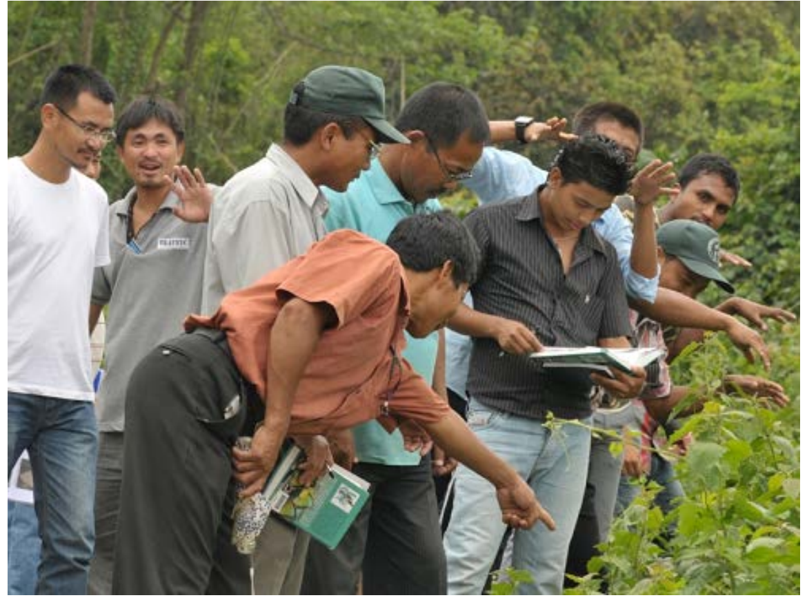
Learning to watch butterflies in the field

Participants in natural history training programme with Pakke Jungle Camp, Ghora-Aabhey Society and Pakke Tiger Reserve Forest Department.