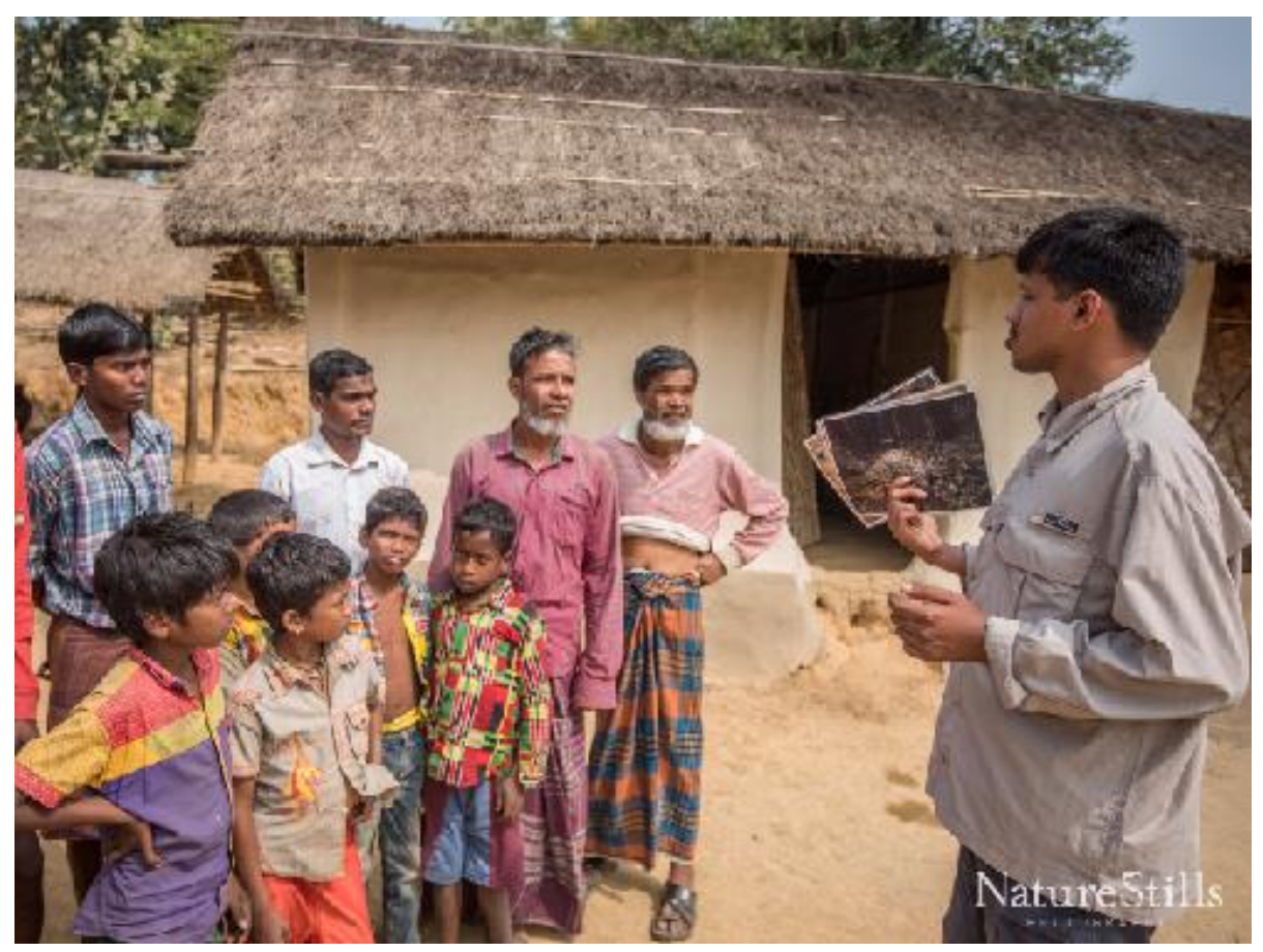
Meeting with Forest Officials

From 20th February to 1st March 2017 we met with five forest officials, Conservator of Forest (Chittagong Circle), Divisional Forest Officer of Banderban, Coxsbazar South, Coxsbazar North and Sylhet Forest Division We delivered the concept note of our pangolin survey project and a copy of permission letter along with our survey plan. They assured all out of help during the study period.