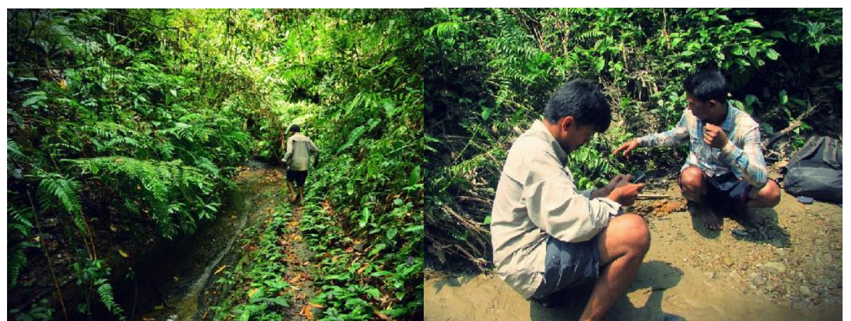
Left: Rajkandi Reserved Forest. Right: Documenting information on Pangolins sign and burrow.

We conducted our interview survey with the 15 local people who frequently go to the forest and are living adjacent to the forest. Most of them reported the illegal hunting of pangolin in this reserve.