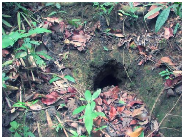
An unused burrow of pangolin.