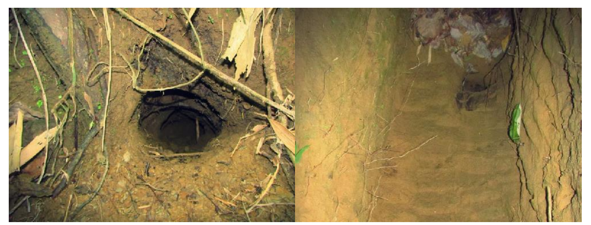
Left: Active burrow of pangolin. Right: The excavated burrow of pangolin.