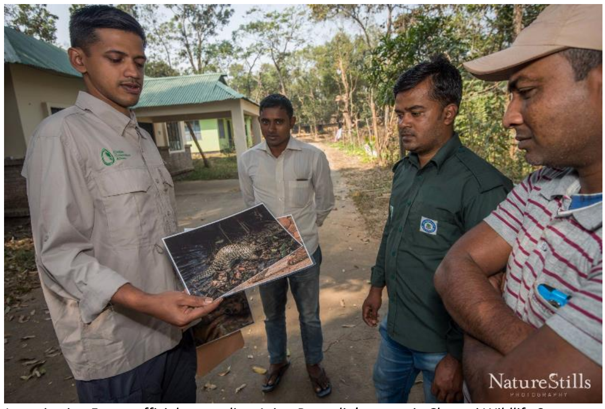
Interviewing Forest officials regarding Asian Pangolin's status in Chunati Wildlife Sanctuary

Chunati Wildlife Sanctuary - is one of the protected area of Bangladesh which is considered as one of the habitat of Asian elephant. Upon the suggestion of Bangladesh Forest Department we included this forest site in our project. We visited this wildlife sanctuary from 11th February to 16th February 2017. A semi-structured questionnaire survey and focused group discussion was conducted. The forester of this protected area was previously worked in Pablakhali Wildlife Sanctuary (PWS) which is another study site for our Asian pangolin project. We also collected information on the Asian pangolin at PWS during this time.