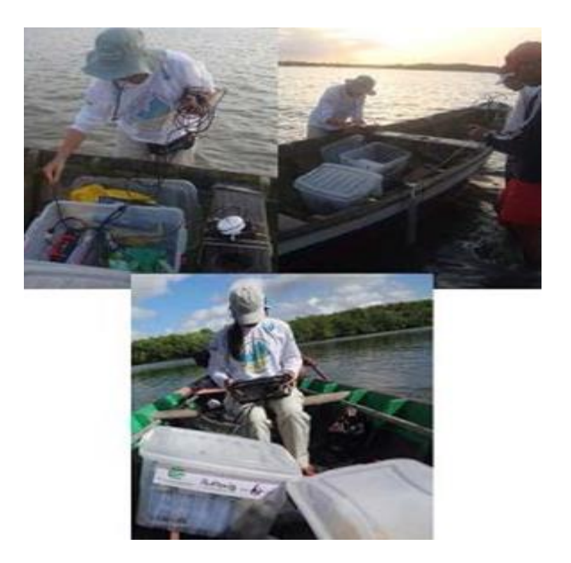
Figure 1. Boarding outputs.

Activity 1: Verify the viability of the use of sidescan sonar to estimate the abundance of the Antillean manatee on the estuary