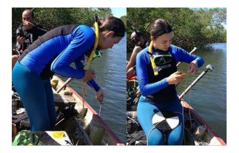
Figure 10. Measurement of water turbidity using Secchi disc.

During the second semester of the project the field team recorded the presence of manatees in all stretchs (I, II and III). The stretch where the animals were found and where efforts were focused was III (Carpina river), followed by I (Bar river) and II (Ubatuba river). The option to increase the effort in the stretch III gave up the need to optimize the encounters with animals to obtain sufficient data for the study to estimate abundance. Although other variables have to be studied more deeply, the main characteristic of phrases that may be influencing the presence of animals is the predominance of food banks. Environmental variables collected to date were: salinity, depth, turbidity (Figure and temperature. All data were and will be 10) the water planned analyzed together to map the characteristics of the places chosen by the animals.