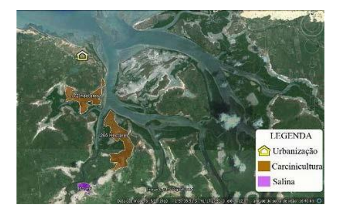
Figure 5. Threats related to habitat loss identified on the study area

During the boat trips, all the anthropic activities were marked on the GPS (Figs. 5 and 6).