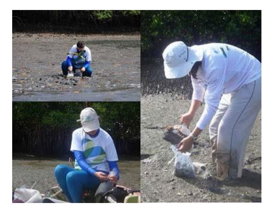
Figure 9. Sediment samples collections during the period.

Activity 5: Describe the variables (biotic, physiographic and physicochemical), that influence the spatial and temporal distribution of manatees on the estuary