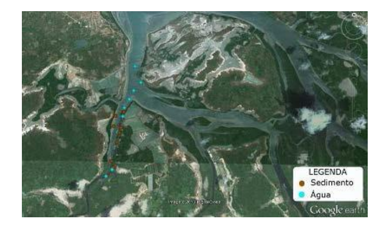
Figure 7. Location of the water and sediment samples collected