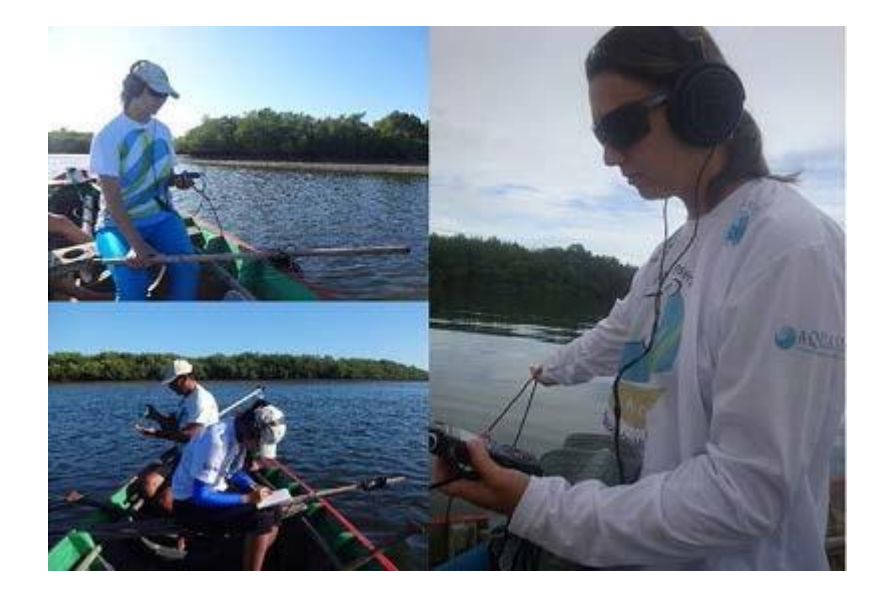
Figure 4. Field team recording the Antillean manatee vocalizations.

Activity 3: Identify the threats and the human impacts on the Antillean manatee on the estuary.