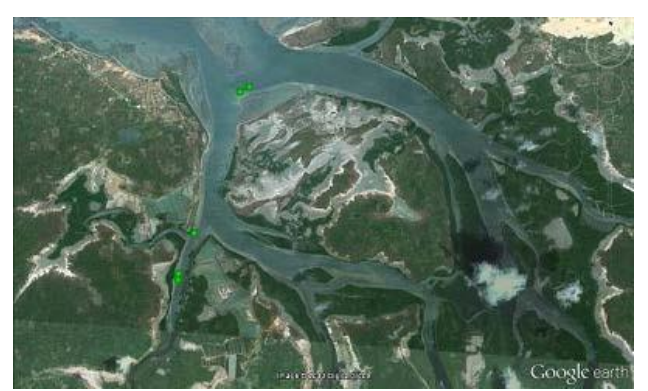
Figure 11. Map with the location of algae and seagrass banks (green points) identified in study area.

During the field trips conducted in March, April, May and June 2013 were identified five (05) areas with banks of algae and seagrass (Table 7 and Figure 11). The area of the seagrass bank, located next to a corral disabled and an asset at the end the stretch III, was found with marks pectoral fins of animals that fed there (manatees rely with the pectoral fins on the substrate while are feeding). Already banks of algae were found near two large sand banks (also called regionally "crôas") that are exposed at low tide in tidal moon (full and new). All feeding areas found in this period contained in the Carpina river.