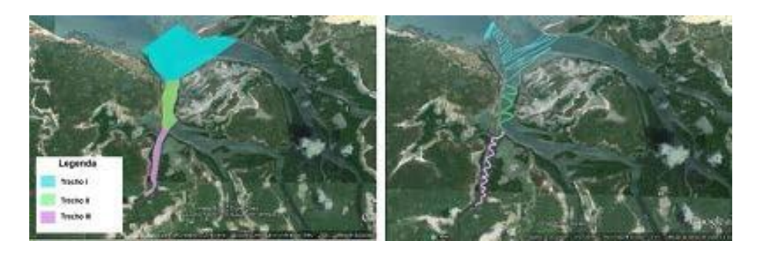
Figure 2. Study area with the stretches established