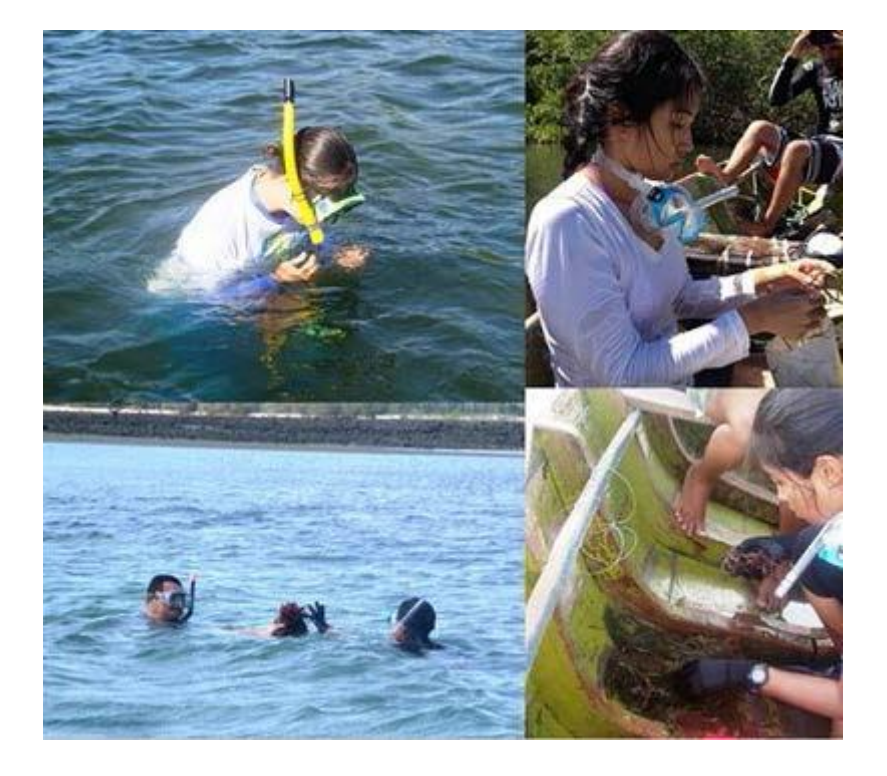
Figure 13. Diving, submerged vegetation collection, sorting and storage of vegetable items collected.

During the field trips conducted in March, May and June 2013 were Samples of submerged vegetation (Figure 13). With the help of the researcher and algae specialist, biologist Pedro Bastos - Macroalgae Laboratory of the Institute of Marine Sciences (LABOMAR) Federal University of Ceará, seven (07) species were identified and two distinct genus. Until now have been identified: two (02) genus of brown algae, three (03) species of red algae and (08) species of green algae (Table 8).