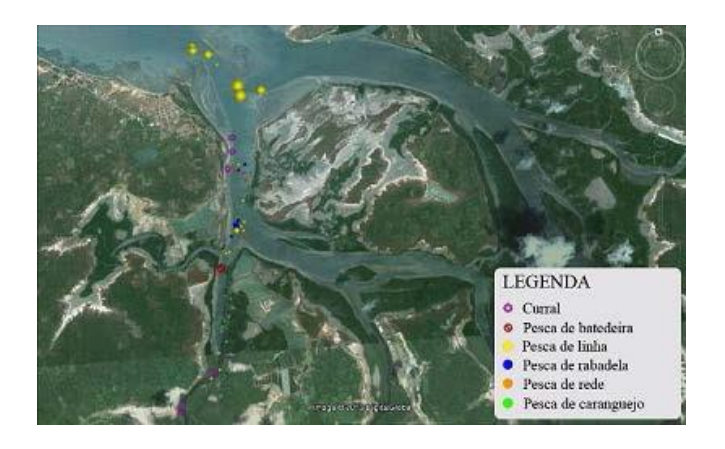
Figure 6. Threats related to fishing activities identified on the study area.

Activity 4: Identify and monitor the environmental quality of the estuary, through estuary water and sediments analysis.