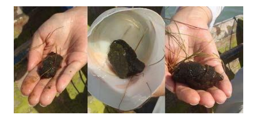
Figure 12. Three (03) faecal samples of manatee found drifting in the same day and near the place where the animals were sighted in stretch I (bar river)

During the field trips conducted in March, May and June 2013 were Samples of submerged vegetation (Figure 13). With the help of the researcher and algae specialist, biologist Pedro Bastos - Macroalgae Laboratory of the Institute of Marine Sciences (LABOMAR) Federal University of Ceará, seven (07) species were identified and two distinct genus. Until now have been identified: two (02) genus of brown algae, three (03) species of red algae and (08) species of green algae (Table 8).