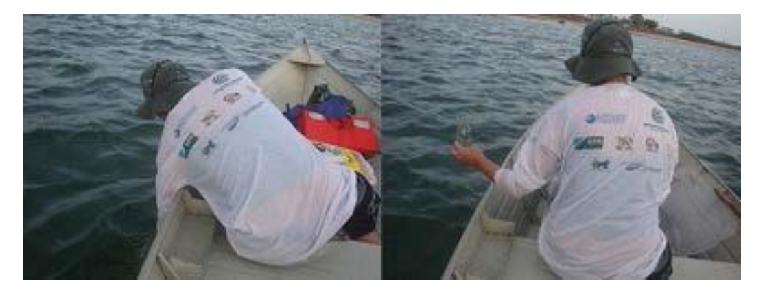
Figure 8. Water samples collections during the period.