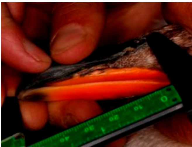
Gentoo bill measurements for sexing penguins.

The last few field trips for the Gentoo penguin tracking work were extremely challenging. With near record rain falls it made for some interesting work. Thankfully with some tough volunteers we were able to reach our target goals for number of trackers deployed. The lab work is currently underway and preliminary results are indicating differing foraging strategies among the various sites we are working at. At present we have confirmed eight different fish, five cephalopods and three crustacean species in the diet. We have been working closely with the Falkland Islands Fisheries Scientists who have assisted with species identification. As part of a marine themed term an interactive session was done with the Falkland Islands High School. The importance of understanding animal diets was explained. Once all stomach samples have been worked through in the lab, isotope samples will be prepared for a greater understanding of Gentoo diet.