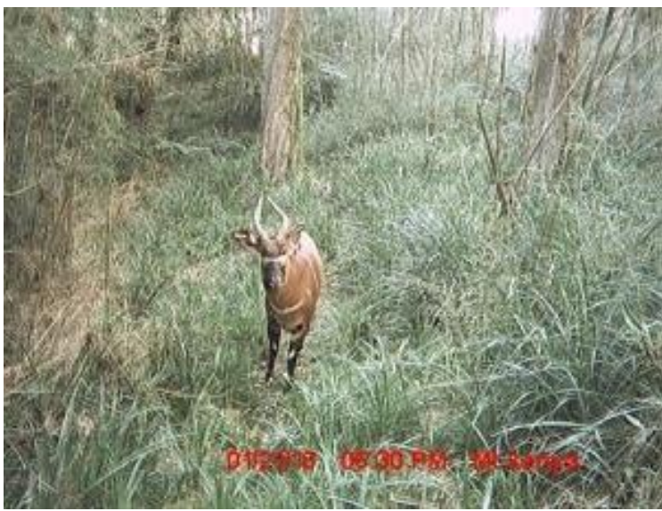
SW Mt Kenya Ragati Bongo – January 2013