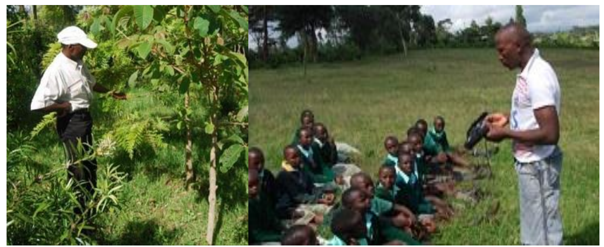
Tree planting – Peter Munene checking growth. Camera trap demonstration and Bongo Hot spot