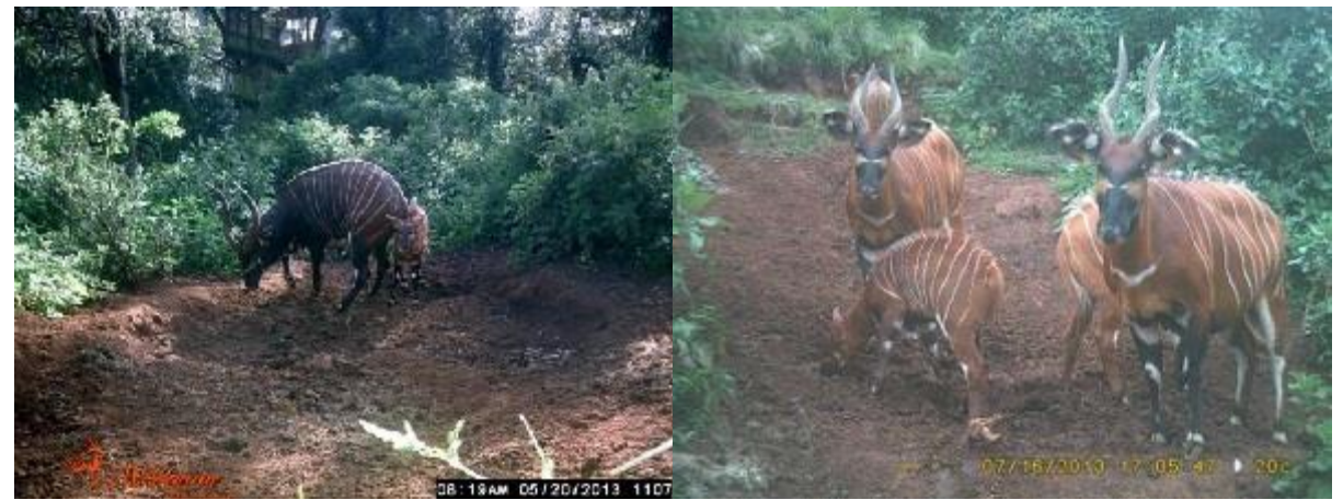
BSP Tracker Team – Aberdares Camera Trap Photographs – Honi Bongo – with young