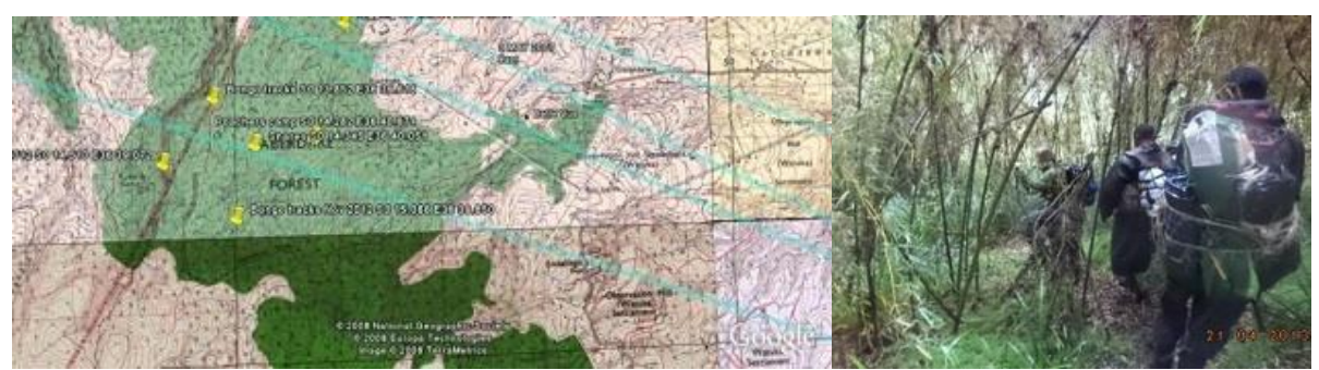
Map of Mt Kenya – showing BSP Tracking. Photo of BSP Tracker team SW Mt Kenya - April 2013

These activities would not be possible without your grant. Bongo Surveillance Programme – Monitoring Results