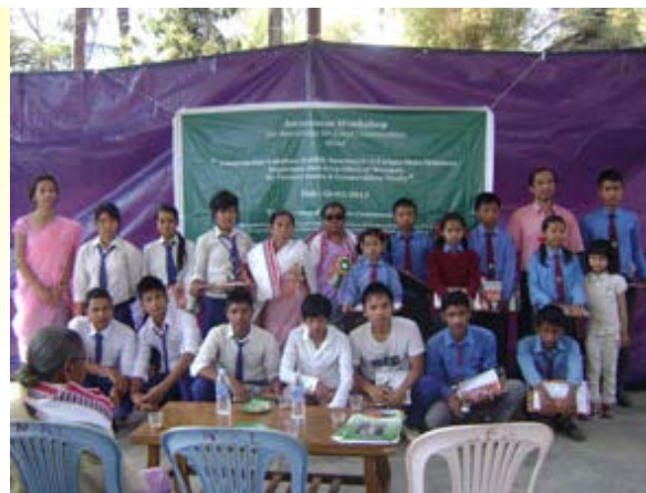
Awareness poster and workshop