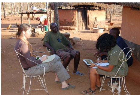
An interview in the communal areas around the Matetsi safari area

In each area we set up camp and interviewed people who have knowledge about what is happening on the ground, for example national parks rangers, area managers and ecologists, safari guides, hunters, trackers and forestry commission staff. We have driven more than 4300 km's and have interviewed 190 people to find out whether cheetahs occur in the respective areas and what conservation challenges the cheetahs are likely to face. It is exciting to hear that cheetahs were seen in most of the areas we covered, sometimes once a year sometimes every month. In none of the areas human-cheetah conflict seemed to be an issue. With the exception of one case in a village close to Hwange National Park several years ago, there were no reports of cheetahs killing livestock in communal areas. People were generally happy to see a cheetah and more often than not would like to have more cheetahs in their area as they realized this might bring in additional benefits through tourism.