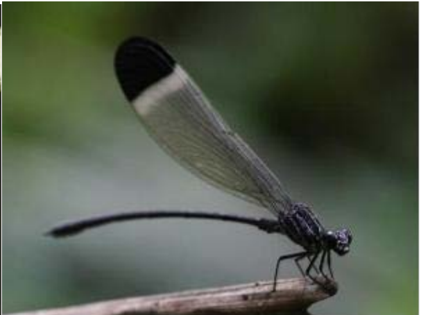
Left: Palaemnema piscicaudata (Platystictidae). Right: Polythore derivata (Polythoridae).