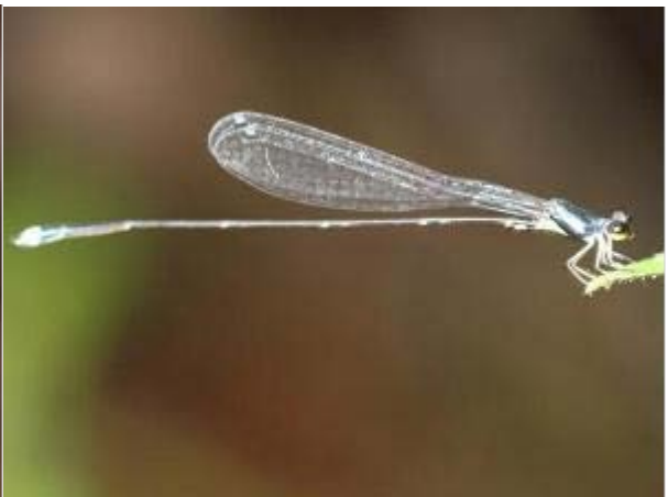
Left: Psaironeura tenuissima (Protoneuridae). Right: Forcepcioneura westfalli (Protoneuridae).