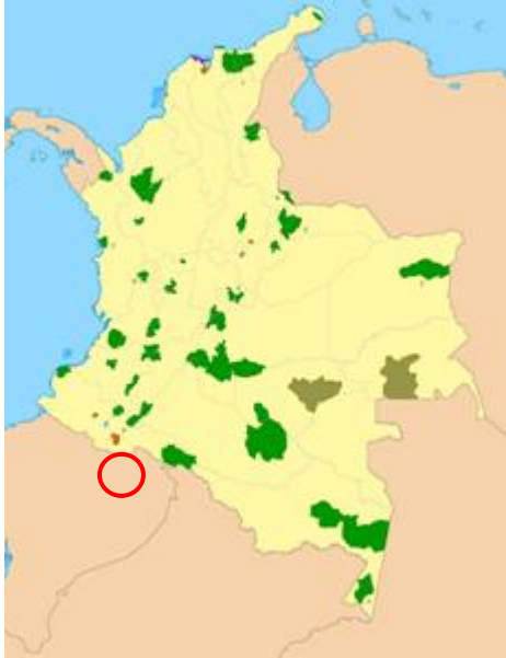
Map of Colombia's Natural Serranía de los Churumbelos National Park (circled in red)

The park is located approximately 1 ° 11 'North and 76 ° 24' West) in the territory of the departments of Cauca - Caquetá - Putumayo - Huila, in the jurisdiction of the towns of San José del Fragua (Caquetá), Santa Rosa, Palestine and Acevedo (Huila) and Mocoa (Putumayo).