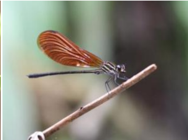
Left: Heteropodagrion croizati (Megapodagrionidae). Right: Polythore concinna (Polythoridae)