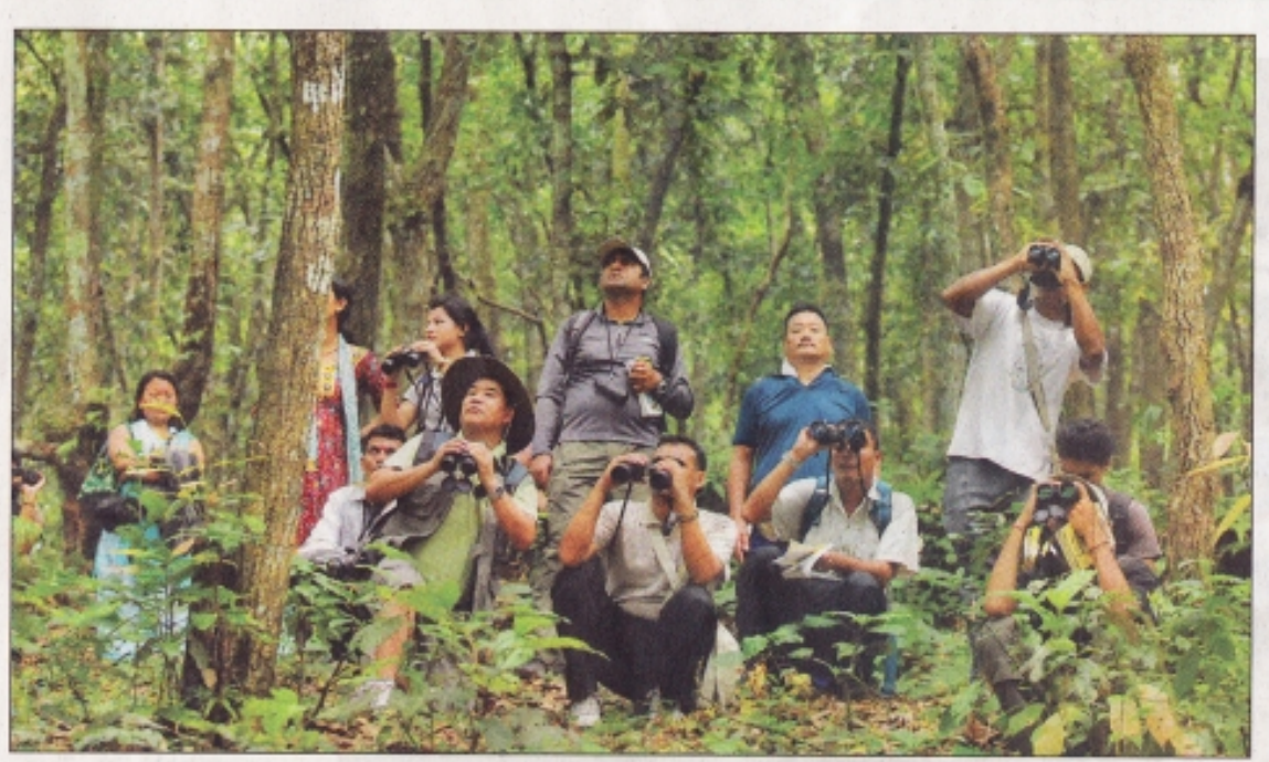
AVIAN DELIGHT | Ornithologists, foreigners and tourism entrepreneurs go birdwatching in Pokhara on Thursday.