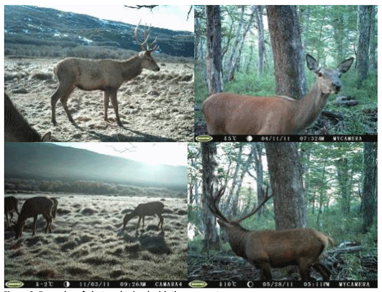
Figure 2. Examples of photos obtained with the camera traps.