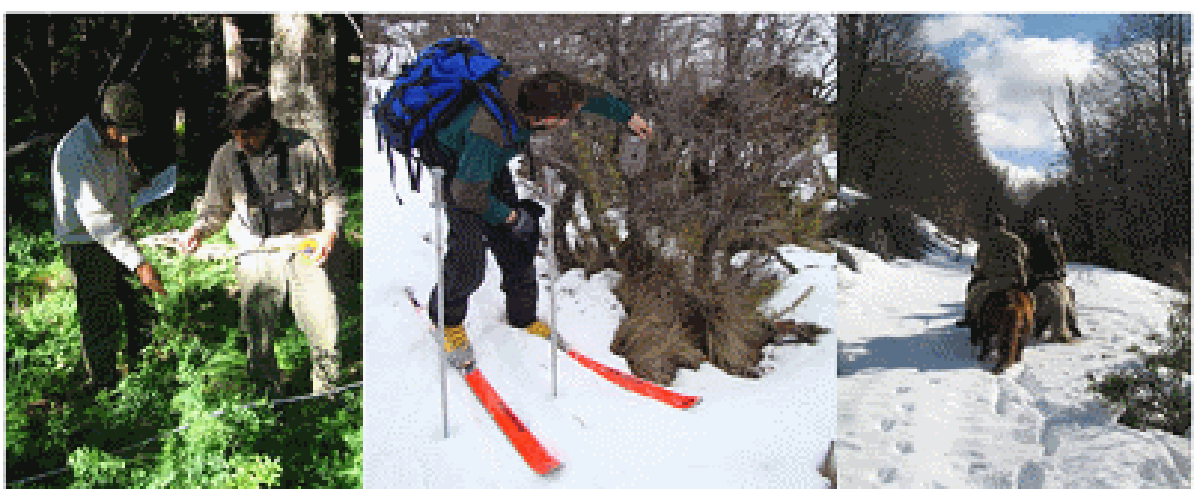
Figure 2. Vegetation impact surveys visit and replacement trap cameras memories and deer sampling surveys during winter season.

and the severity of browsing. On the other hand, the 25% of the sampled forests concentrated the 50% of the browsing. All these results seem to indicate that red deer select particular sites for feeding, those with higher vegetation cover and higher shrubs and tree species diversity. This type of site may have more red deer, or they are using it during more time and therefore, deer produce more browsing severity. In the long term, on these heavily used sites a reduction on plant diversity and structural complexity within the understory should be expected. These changes on vegetation ultimately could affect insect, birds and mammals' abundances and diversity due to habitat modifications produced by the alien invasive deer.