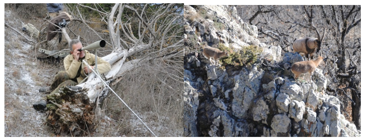
Left: Observing goats in Nuvadi. Right: Mature male courting a female in Nuvadi. Her kid is on the left.