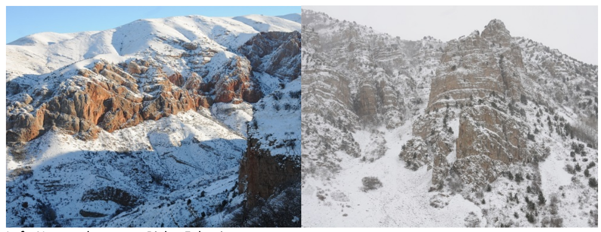
Left: Noravank canyon. Right: Eghegis gorge.