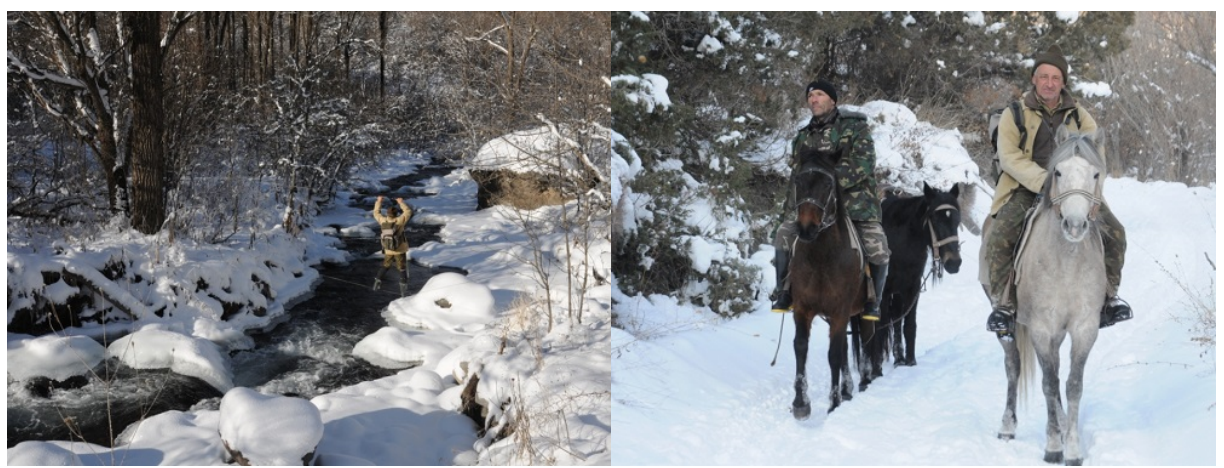
Left: Crossing the river in Kakavaberd. Right: On route in Khosrow.