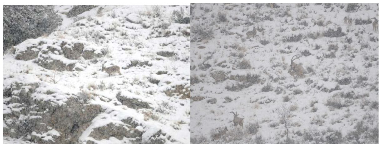
Left: A female with very long horns in Eghegis. Right: Mature male mating with a yearling female just opposite the Observation point in Shatin village in Eghegis Gorge.