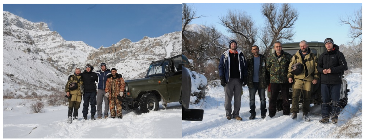
Left: Visiting Ardoikar cliffs. Right: Leaving Kakavaberd.