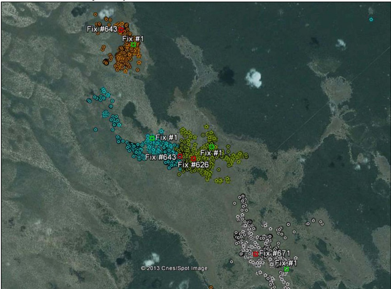
Plate 4: GPS movement trajectories of 4 hirola herds 1-31 January 2013 in the Burathagoin grazing fields. Note the pronounced avoidance of tree cover (dark green).

Preliminary results from our capture and post-collaring efforts suggest that hirola are selecting open grassland with scattered trees. Hirola strongly avoid dense tree cover (Plate 4), which complements evidence that the geographic range of this species has collapsed alongside tree encroachment over the past 30 years.