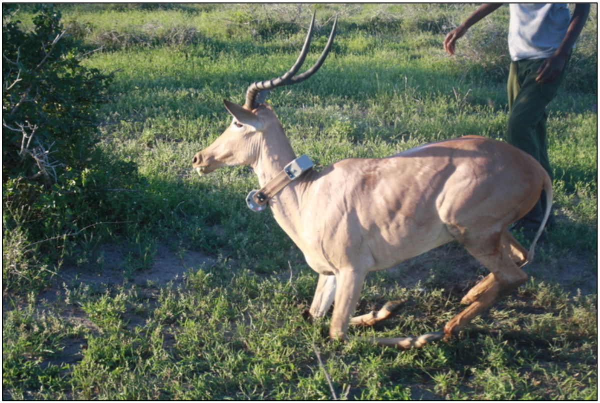
Plate 3: Releasing a collared adult female hirola in Arawale.

We fit three females in Arawale (Plate 3) and six females in Burathagoin with Vectronic Aerospace GPS Plus Iridium collars. In sum, the nine adult females that we GPS collared in 2012 belong to seven groups totaling 51 individuals. Conservatively, we estimate that this represents nearly 13% of the global population (King et al. 2011).