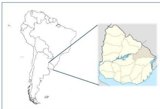
Figure 1. Dashed in the inset is Cerro Largo, one of the departments limiting with Brazil.