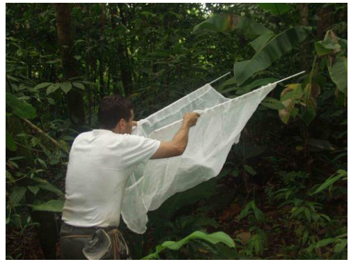
Catching bats with a net.

This challenge has definitely made me ratify that this is what I like to do, and the products of this study, including my doctorate degree, will promote my establishment as a researcher, both.