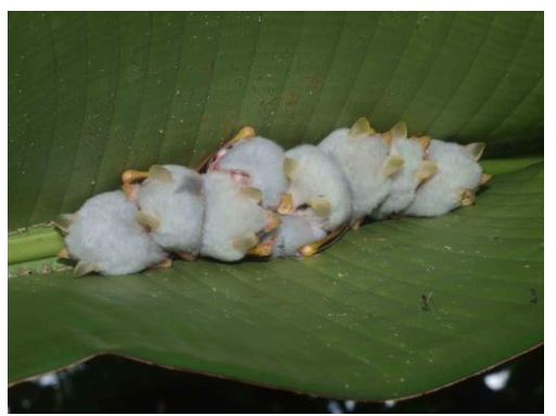
Group in "Roble" tent.