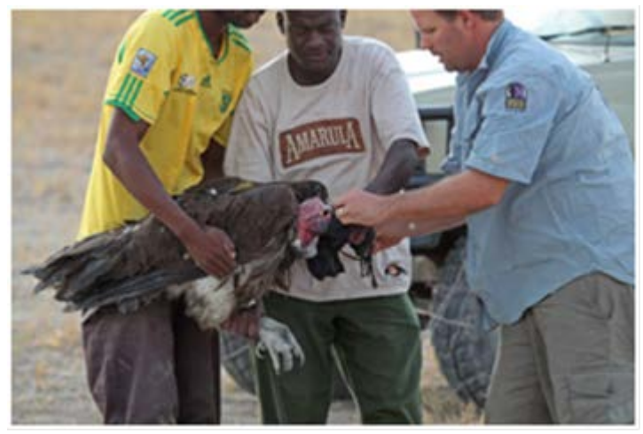
#5 about to be released.

I would like to personally thank Rufford Small Grants for making this preliminary phase of the project - the capture of the vultures and the deployment of the satellite transmitters – possible. Now we can sit back and monitor the movements of the birds wherever they are in the sub-region!