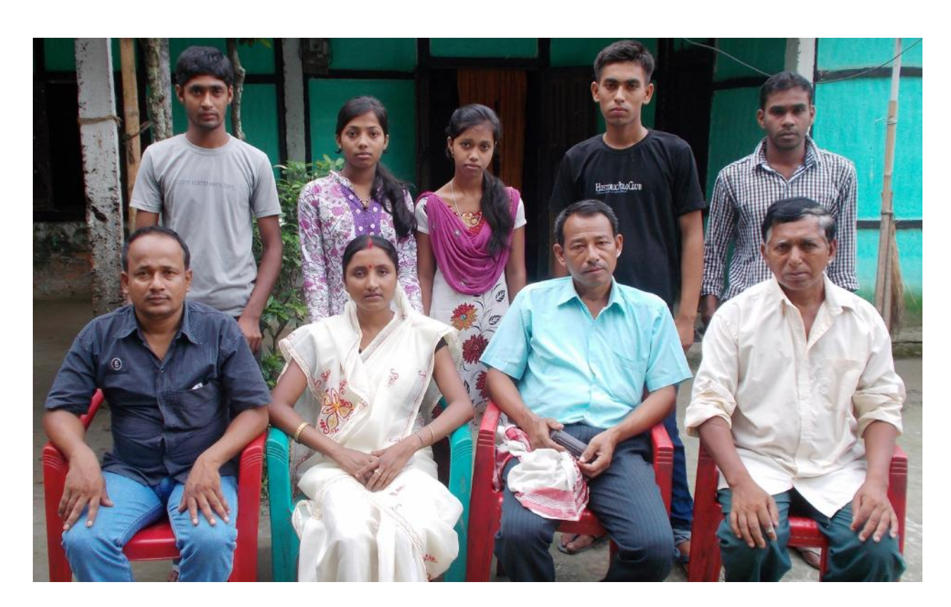
Fig-20: DCN unit members of Majuli area