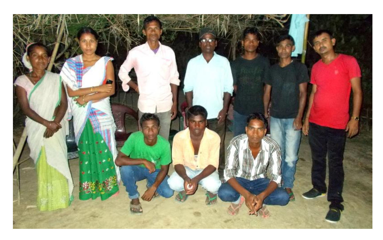
Fig-1: DCN unit members of Aklandghat