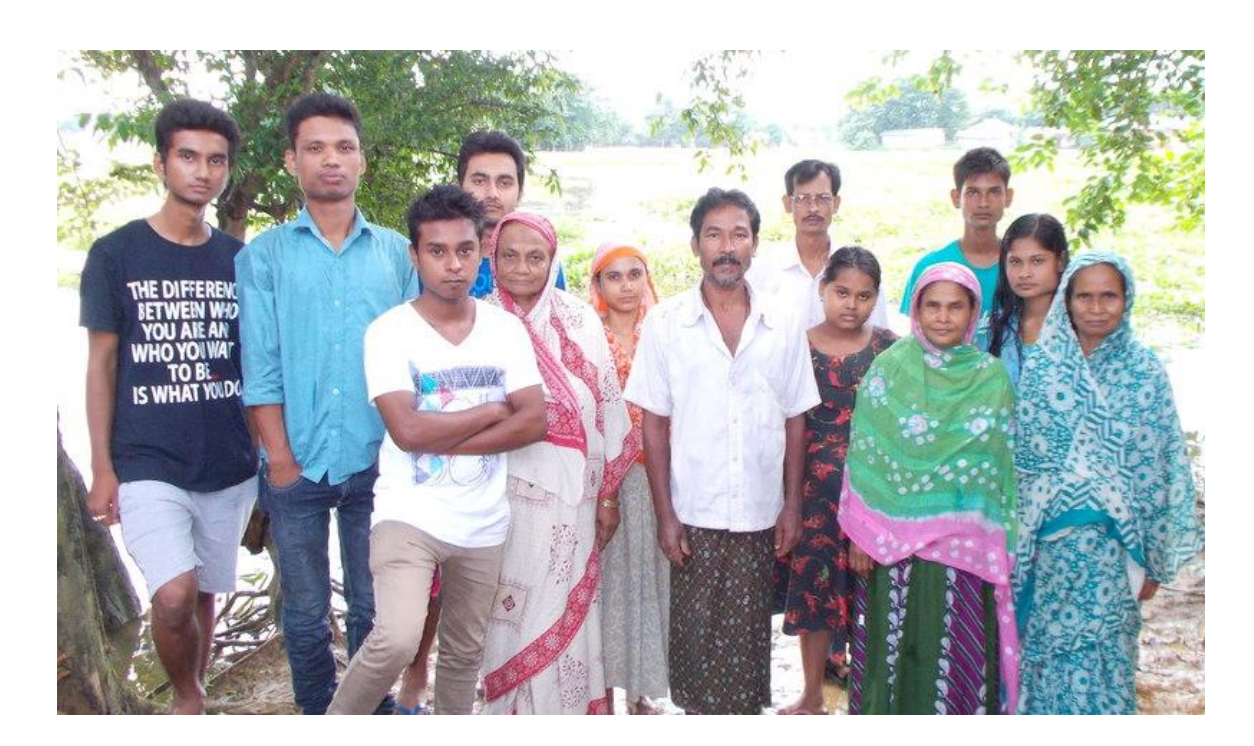
Fig12: DCN unit members of Goalpara area