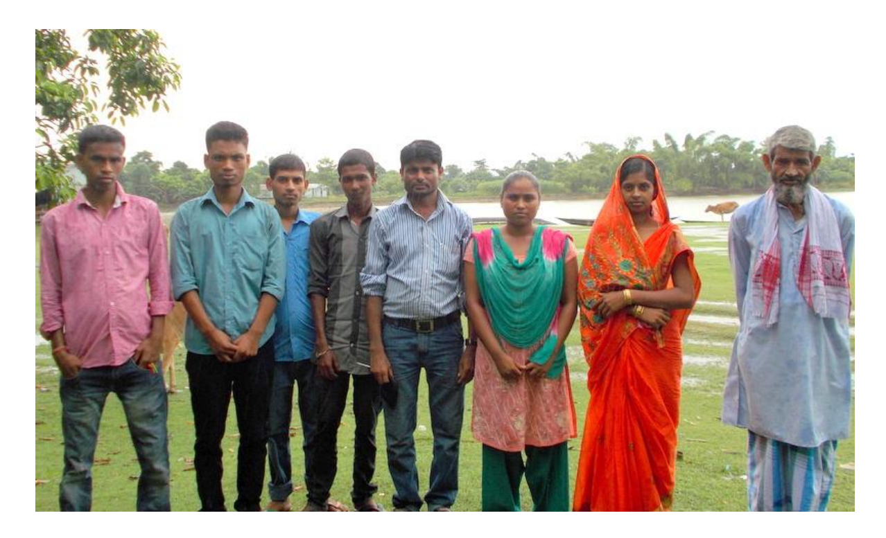
Fig-21: DCN unit members of Pahumara area