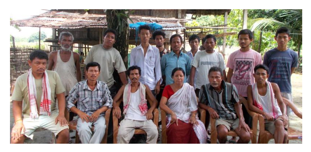
Fig-11: DCN unit members of Disangmukh area