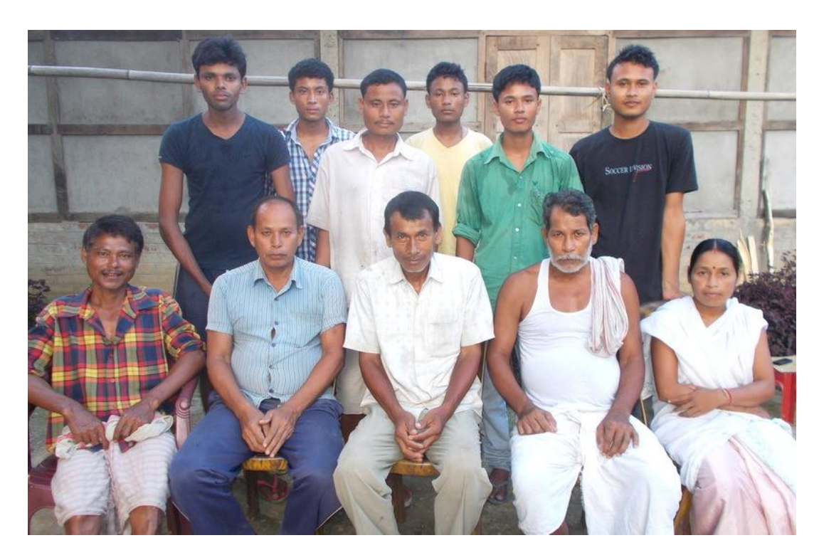
Fig-8: DCN unit members of Dihingmukh area