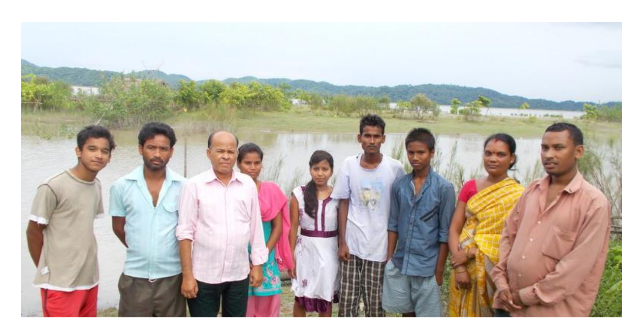
Fig-18: DCN unit members of Kuruwa area