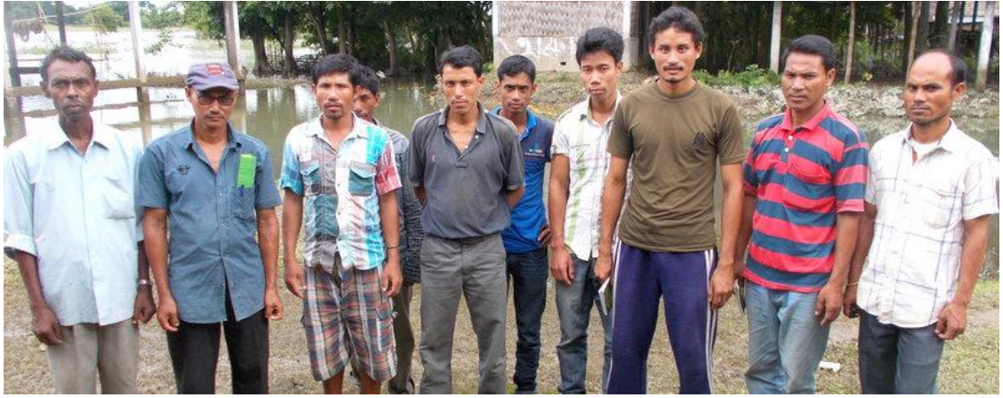
Fig-16a: DCN unit members of Khabolu area