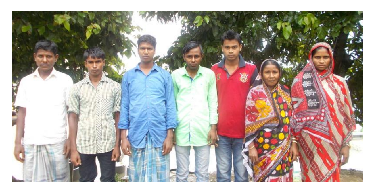
Fig-5: DCN unit members of Bohori area