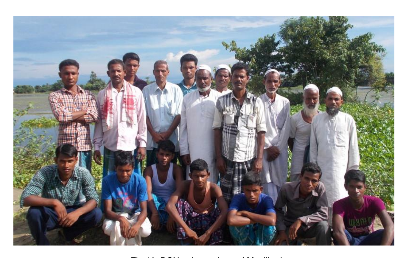
Fig-19: DCN unit members of Maalibari