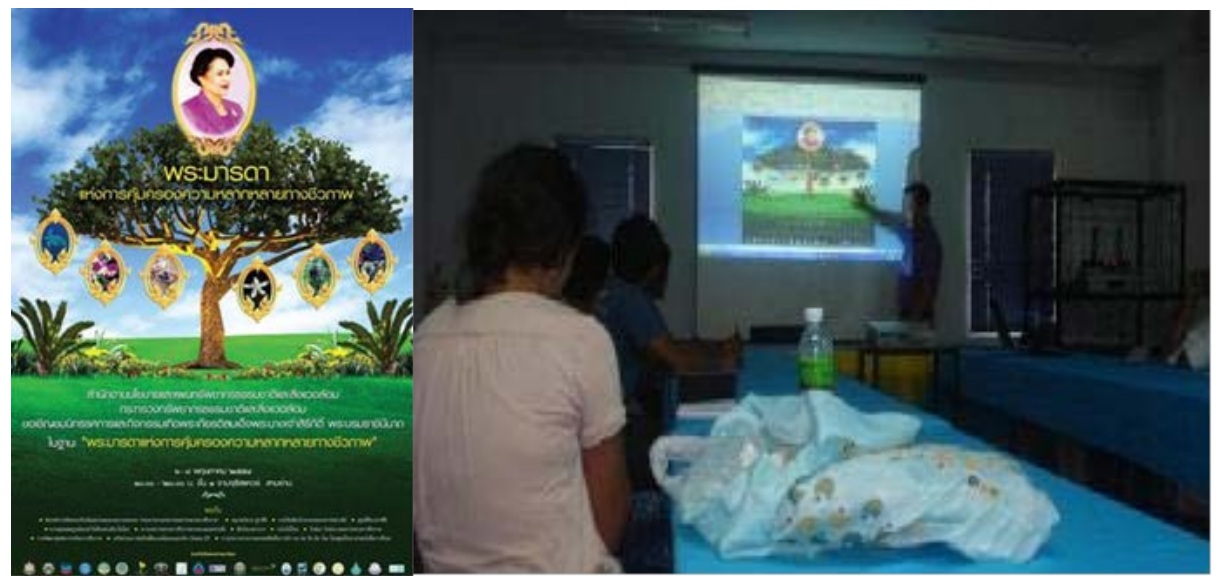
HM the Queen 'the Mother of Biodiversity Protection'

Our RSG project is meant to show gratitude to Her Majesty the Queen, whose roles in reforestation and tree planting campaigns have been well-recognized by all. Her idea is to enable humans and forests to harmoniously live together without destruction.