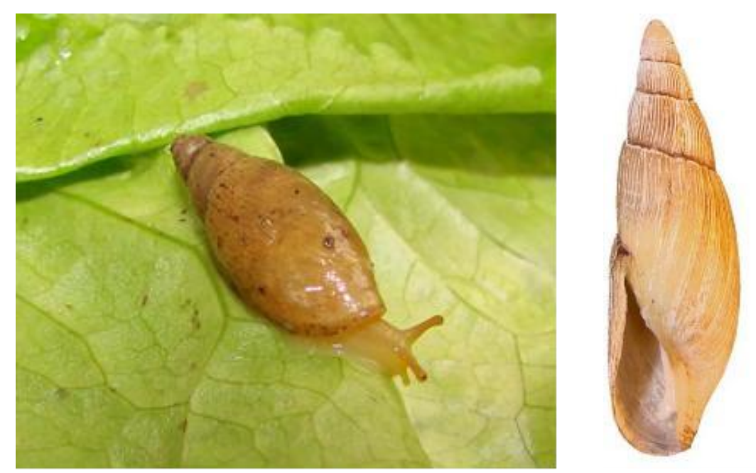
Poiretia mingrelica (point s4, s9)