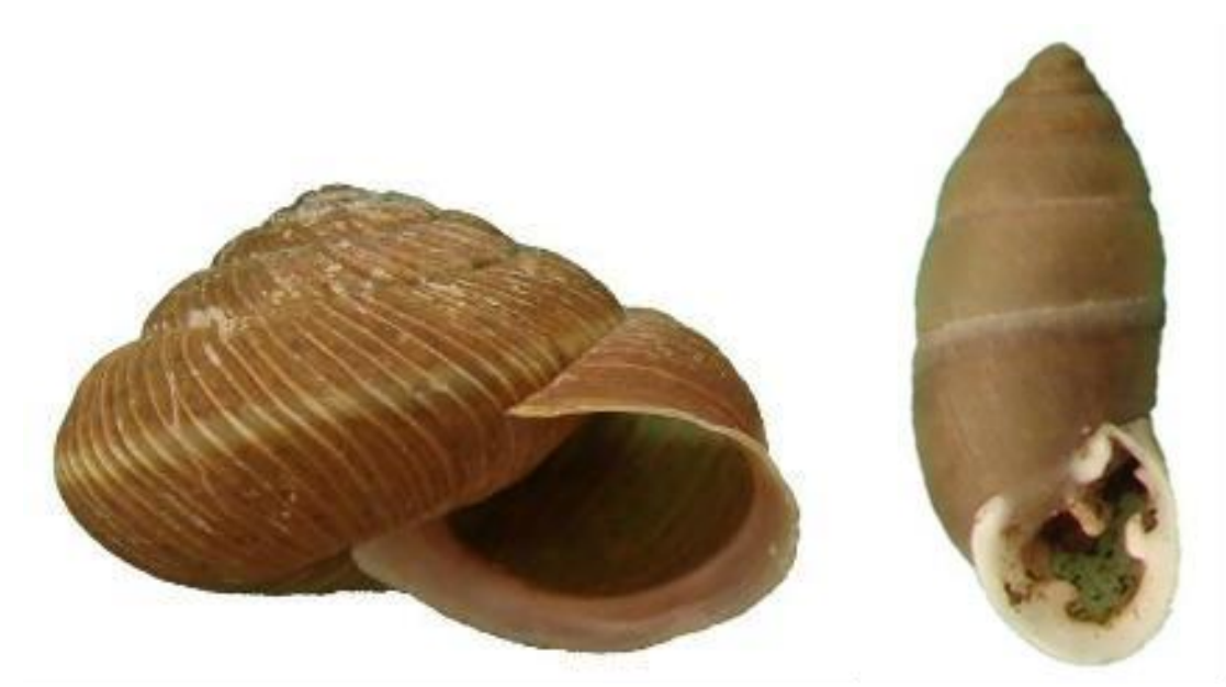
Left: Oscarboettgeria euages (Point s9). Right: Chondrula sunzhica (Point S17, s18)