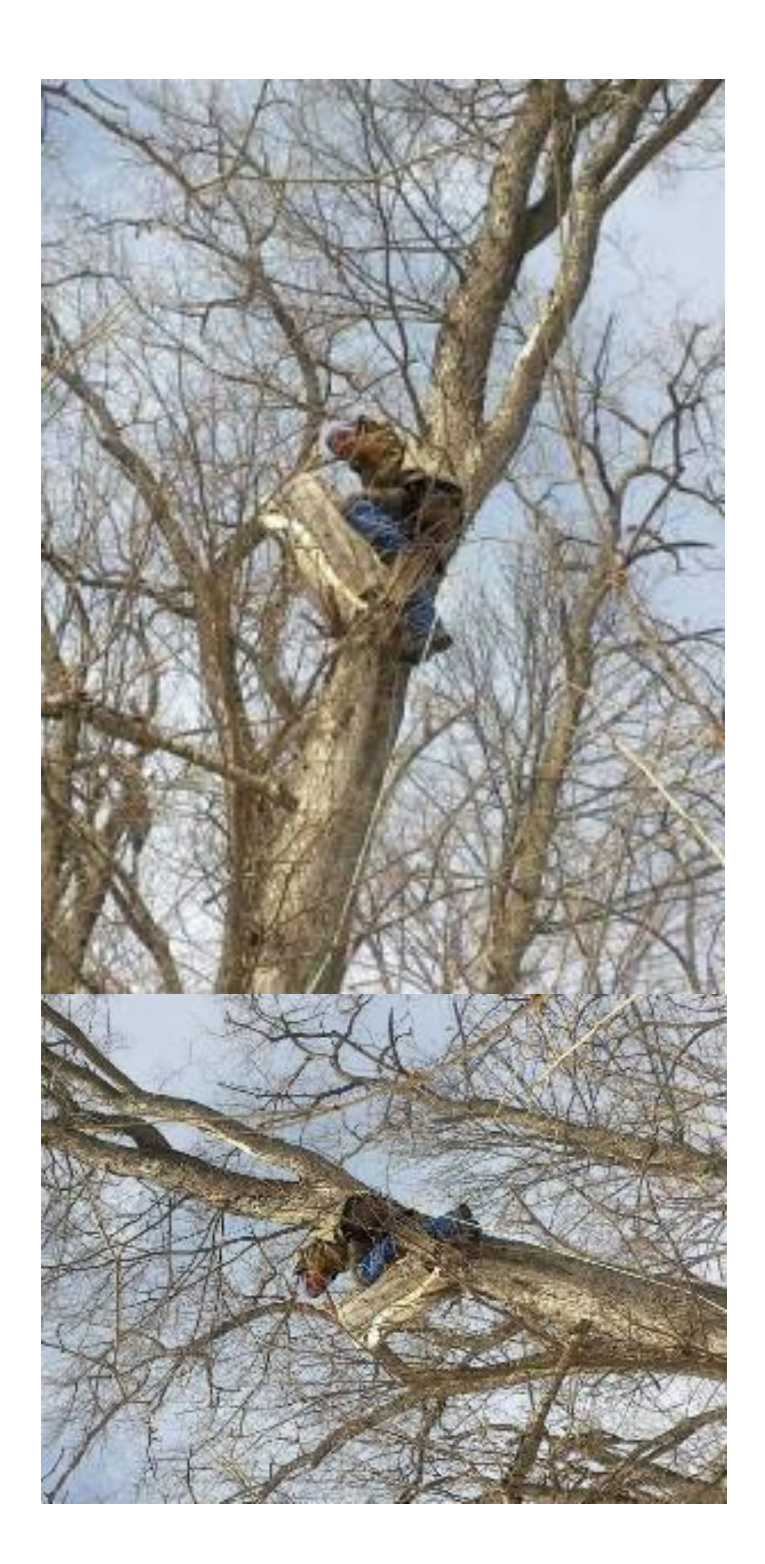
Photo 5. Volunteer Ekaterina Volkova is cleaning nest tube, March 2013.