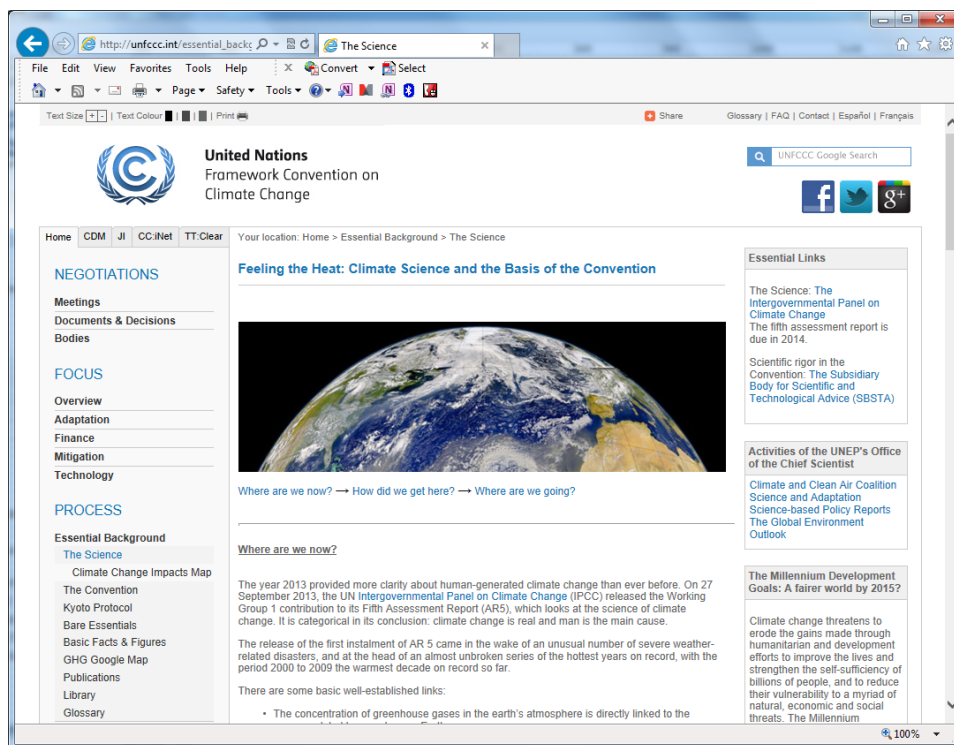
Figure 3 Screenshot of the background web page on science

42. The science web page under the essential background section received 1,963 hits in March 2014 and peaked at 2,236 hits in November 2013, coinciding with COP 19.