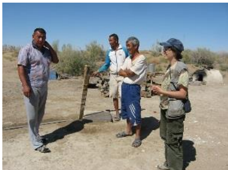
Survey of the local population