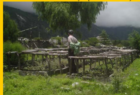
H. salicifolia Nursery, Lete, Mustang

Soak the seed in clean water for three days or 48 hours at hot water of 70^{\circ} C with stirring intermittently until the temperature drops to 10-15^{\circ} C prior to the sowing in the polyplot or bed. Seeds will start germinating within 1-3 weeks based on the condition of the seeds and the species of seabuckthorn and will be ready to plant for the next year.