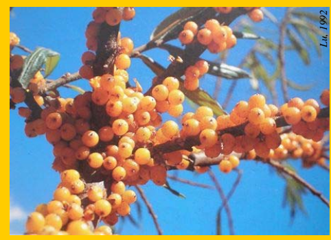
Hippophae salicifolia, Mustang District

Seabuckthorn, found in the icy heights of the Himalaya, is a deciduous, thorny willow-like plant species native to Europe and Asia. It has been distributed in over 40 countries of the world. It is a pioneer species and prefers to grow in low humid, alluvial gravel, wet landslips and riverside with brown rusty-scaly shoots. It is a multipurpose fast growing species which is serving as a measure of biodiversity conservation, soil conservation, medicines, food, fodder and fuel wood. It has an extraordinary capacity to grow and survive under adverse conditions (-40 to 40° C) and has extensive subterranean rooting system with strong soil binding ability useful for soil stabilization, riverbank control and water retention. Out of the seven species and eleven subspecies found in the world, two species (Hippophae Salicifolia and H. tibetana) have been thriving at high altitude areas of Nepal Himalayas. In Nepal, H. salicifolia has been distributed from 2000 - 3600 m from msl whereas H. tibetana has been distributed from 3300 -4500 m.