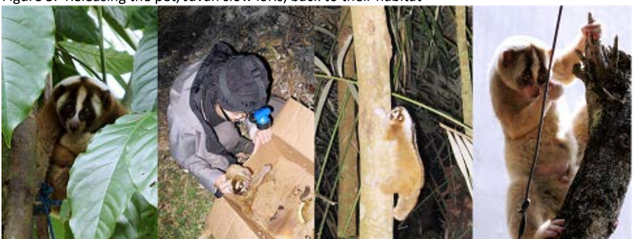
Figure 4. Releasing sites of Javan slow loris in Tasikmalaya & Ciamis, West Java Indonesia

Figure 3. Releasing the pet, Javan slow loris, back to their habitat