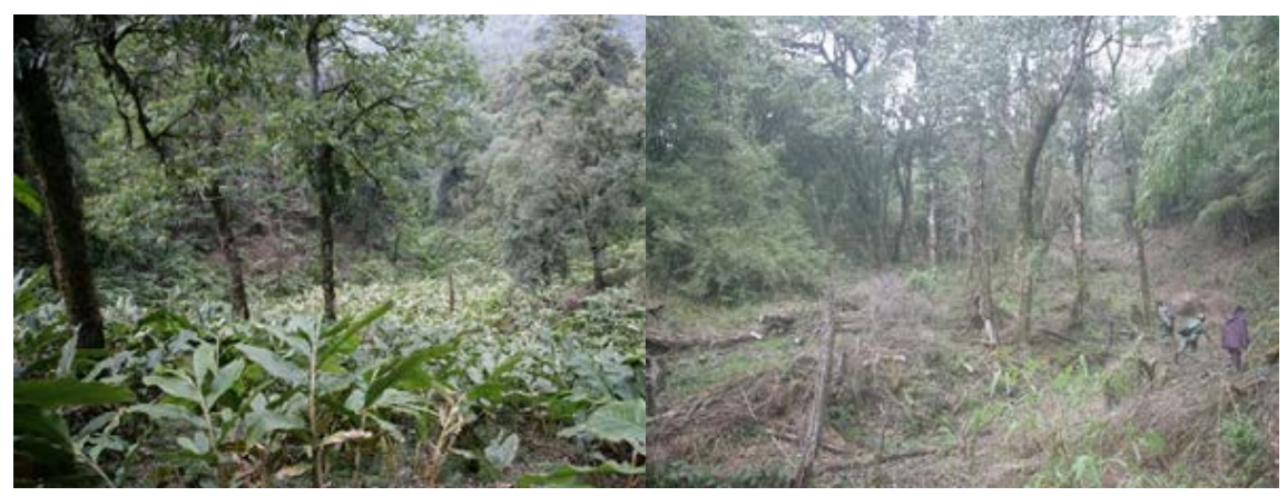
Fig 3 Tsao-ko in valley